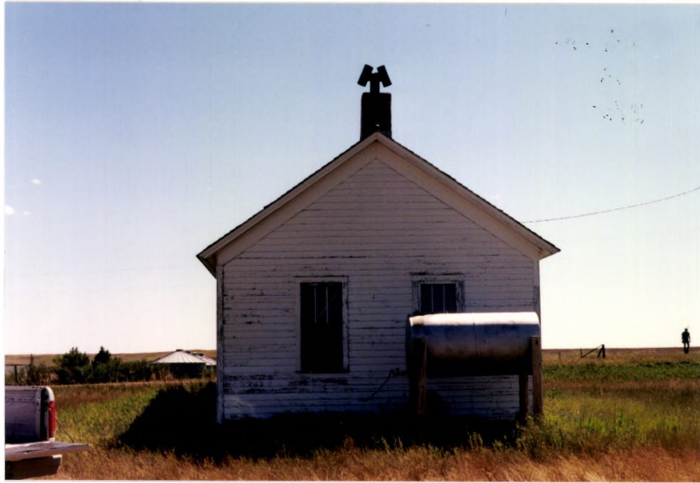
Feature 1, north elevation, view to the south; 970528a, Roll 7, Negative 15.