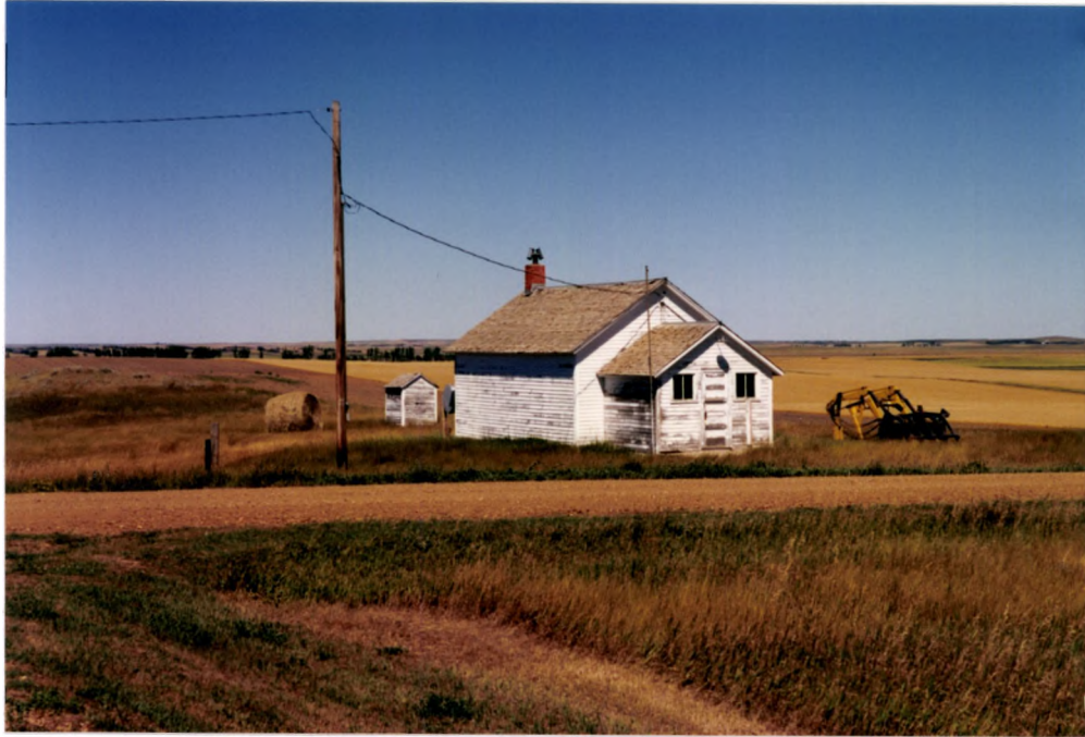
Site overview, view to the northeast; 970528a, Roll 7, Negative 7.