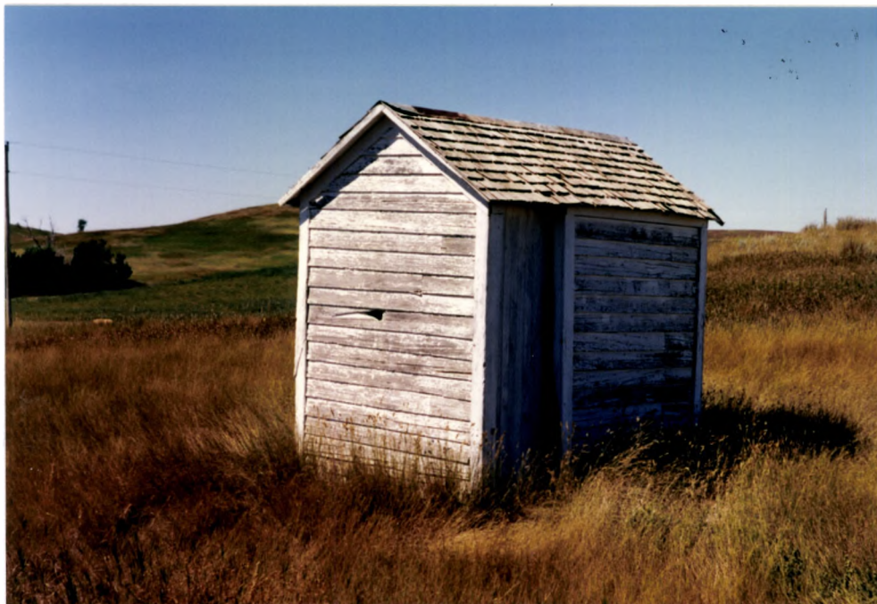
Feature 2, south and east elevations, view to the northwest; 970528a, Roll 7, Negative 19.