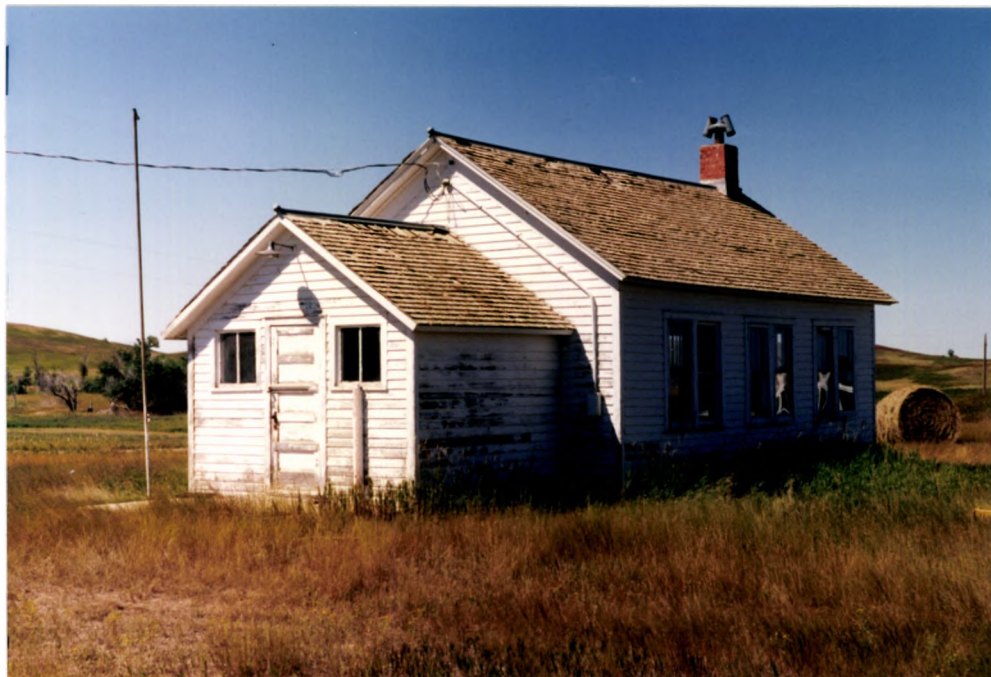
Feature 1, south and east elevations, view to the northwest; 970528a, Roll 7, Negative 11.