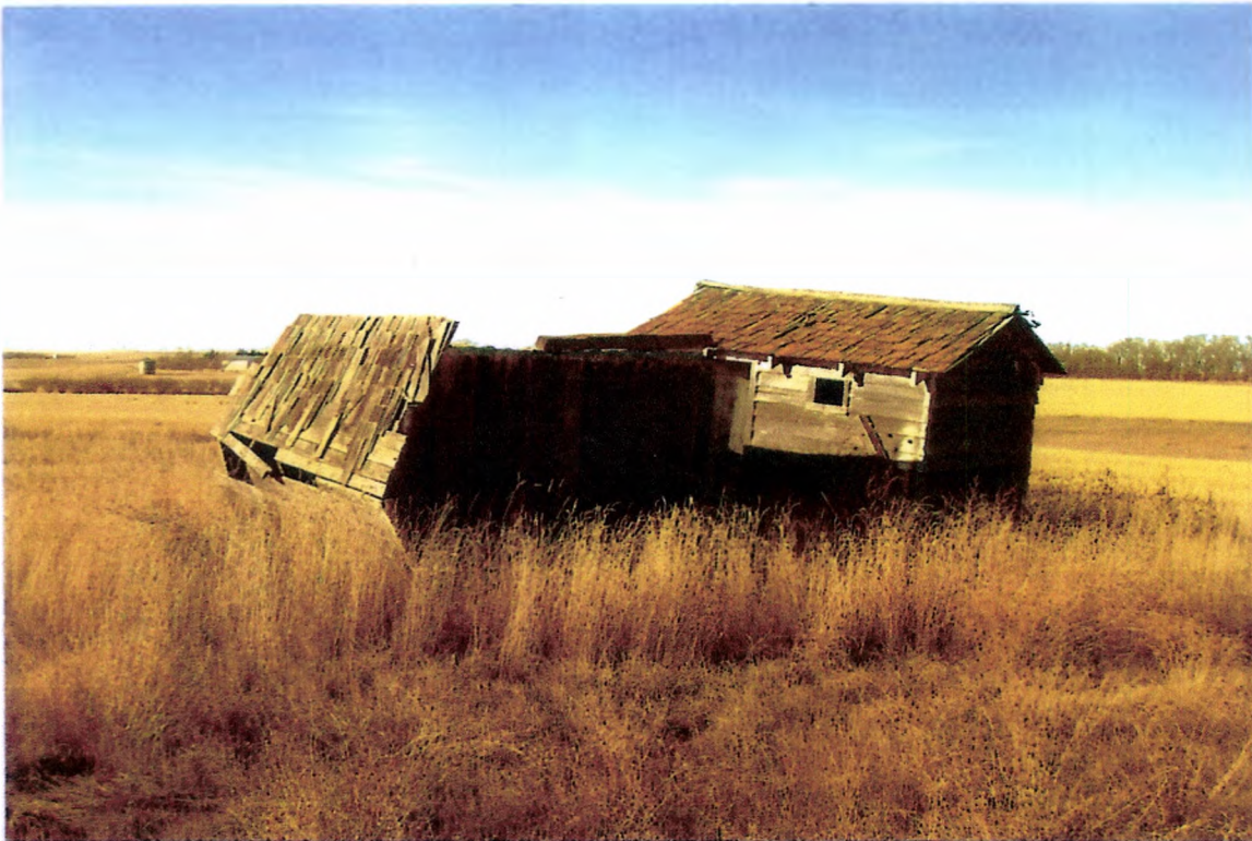
Pair of outhouses (similar style) on NE corner