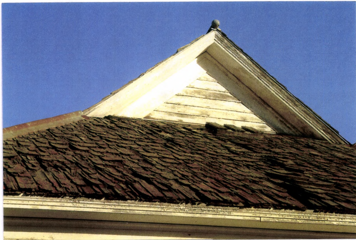
West view of modified hipped gable roof with early cedar shingles.

Complete one Attachments Section for the entire site. Include: Topographic map (with quad name and legal description ), sketch map, photographs, and any other attachments.