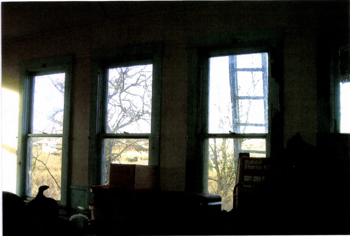
Interior, facing north

Complete one Attachments Section for the entire site. Include: Topographic map (with quad name and legal description ), sketch map, photographs, and any other attachments.