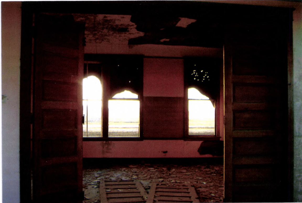
Inside east room, looking west

Complete one Attachments Section for the entire site. Include: Topographic map (with quad name and legal description ), sketch map, photographs, and any other attachments.