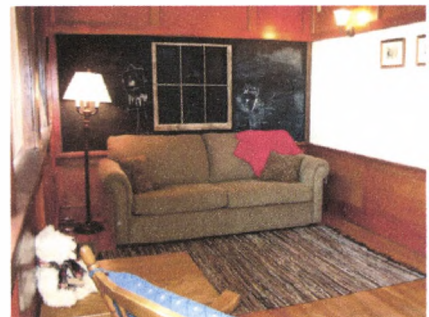
Cozy and inviting