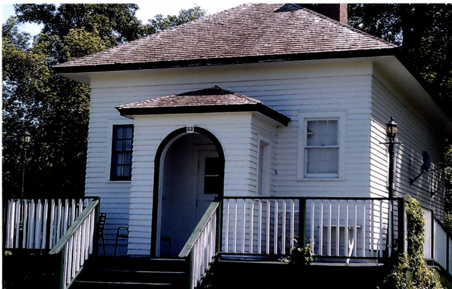
Ellis Nelson School in present location at the Sheyenne Riverbend Farm in Barnes County, Marsh Township, Section 10.