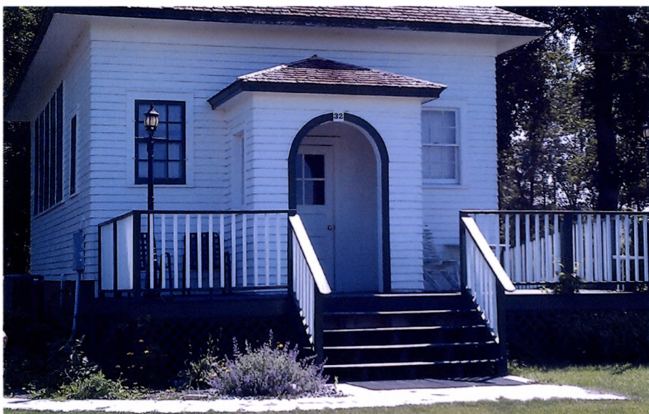
Previous location was Barnes County, Nelson Township, Section 15.