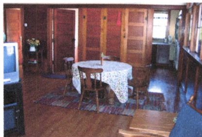
Comfortable lodging in a nostalgic surrounding.