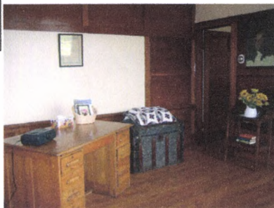
Original Teacher's Desk and Chair