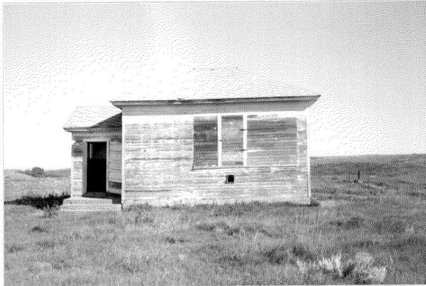
View to north over Plainview School #2 (roll #8-31-95, exposure #13).