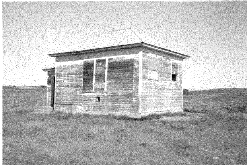
View to northeast over Plainview School #2 (roll #8-31-95, exposure #14).