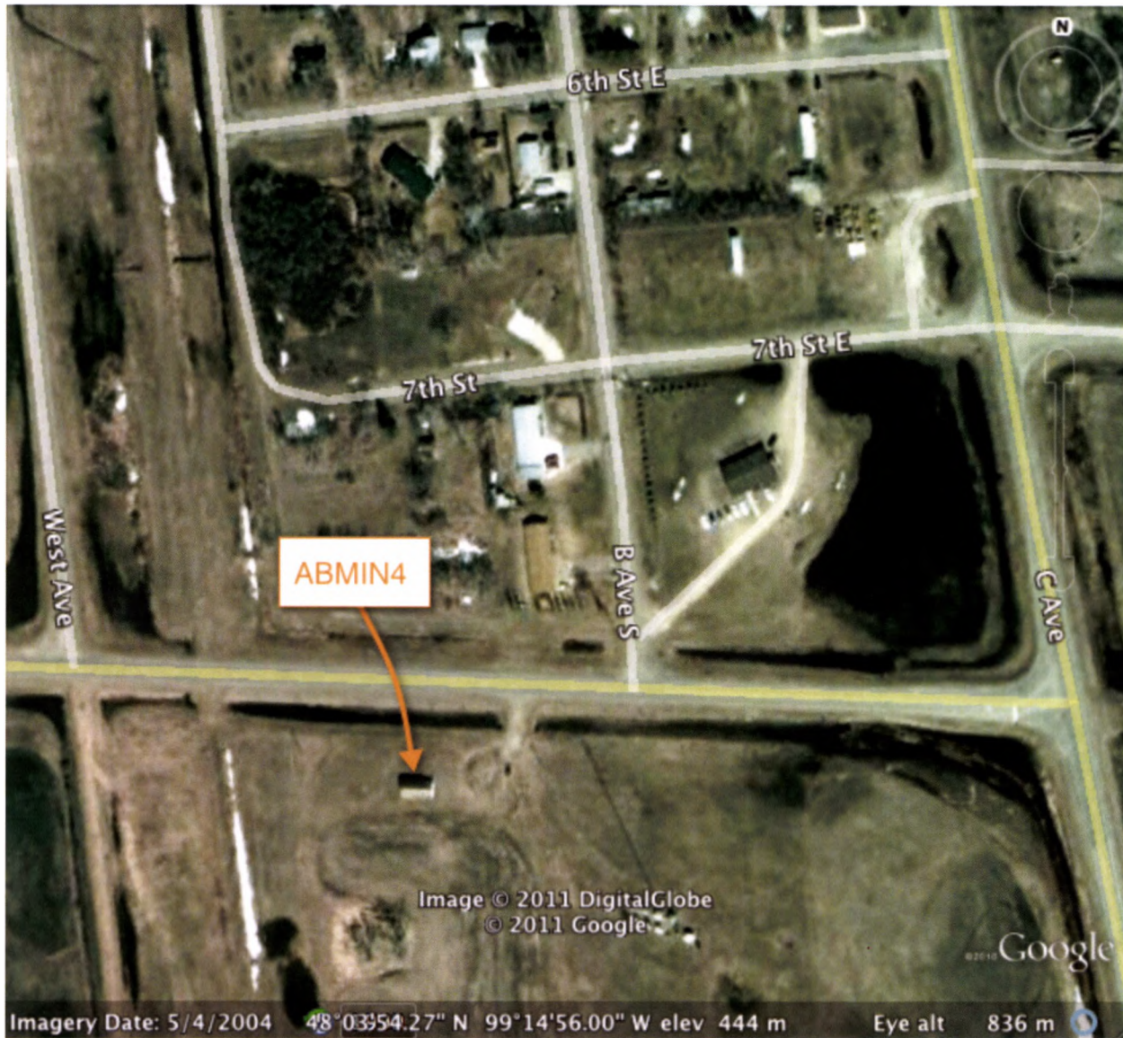
Google Earth map of Feature 1, a schoolhouse on the south edge of Minnewaukan.