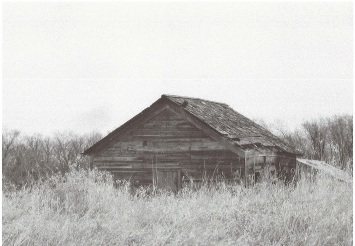
South Side (from the north end)