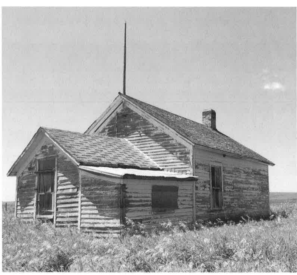
East Side North Side