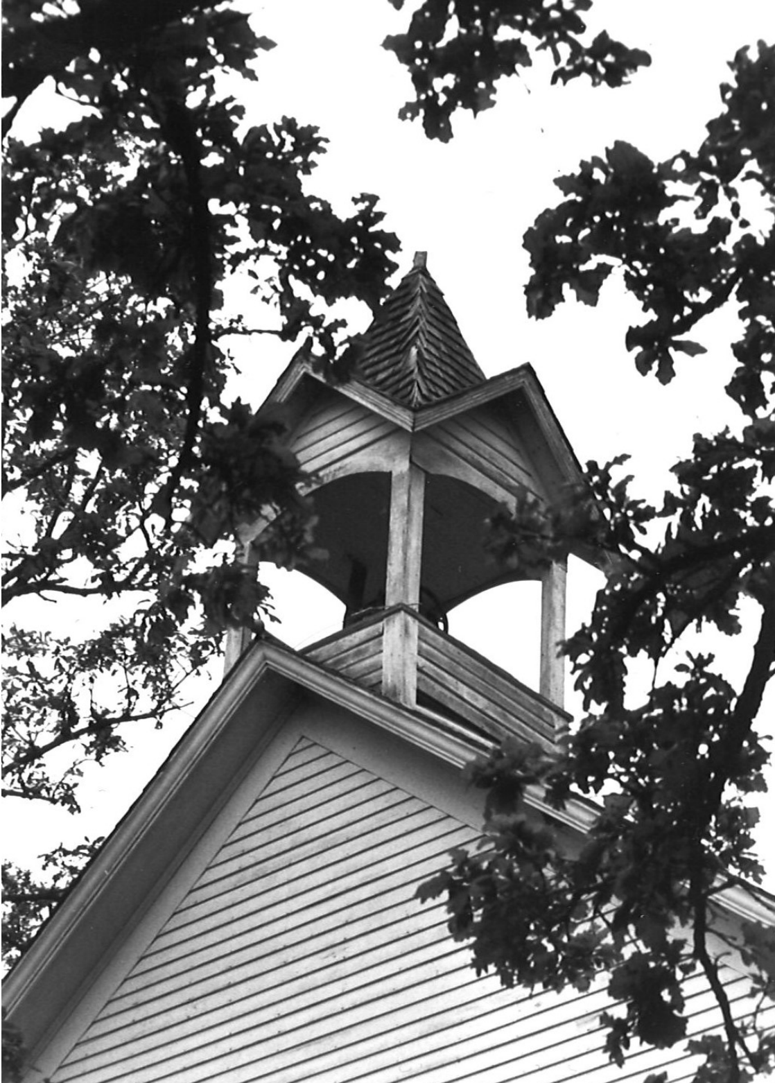
Bell detail from SE, 1984