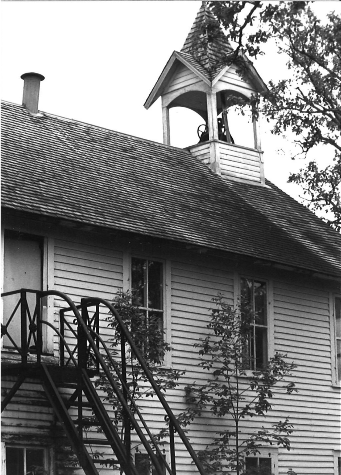
West side from NW, 1984