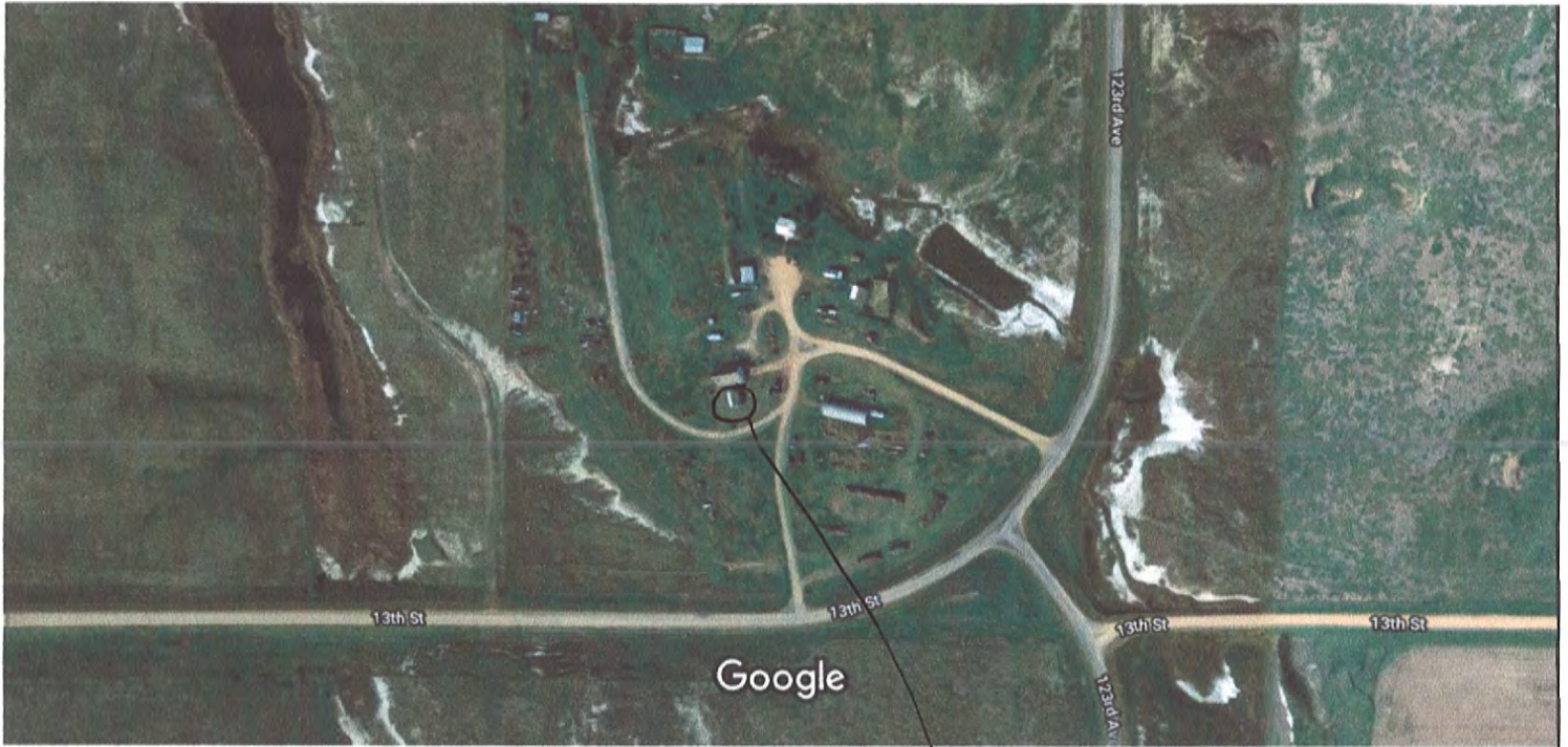
200 ft