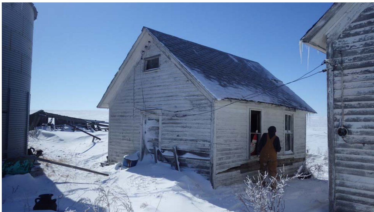
Figure 9: Site MAC-112, Feature 4, view southwest (Image 108-538).