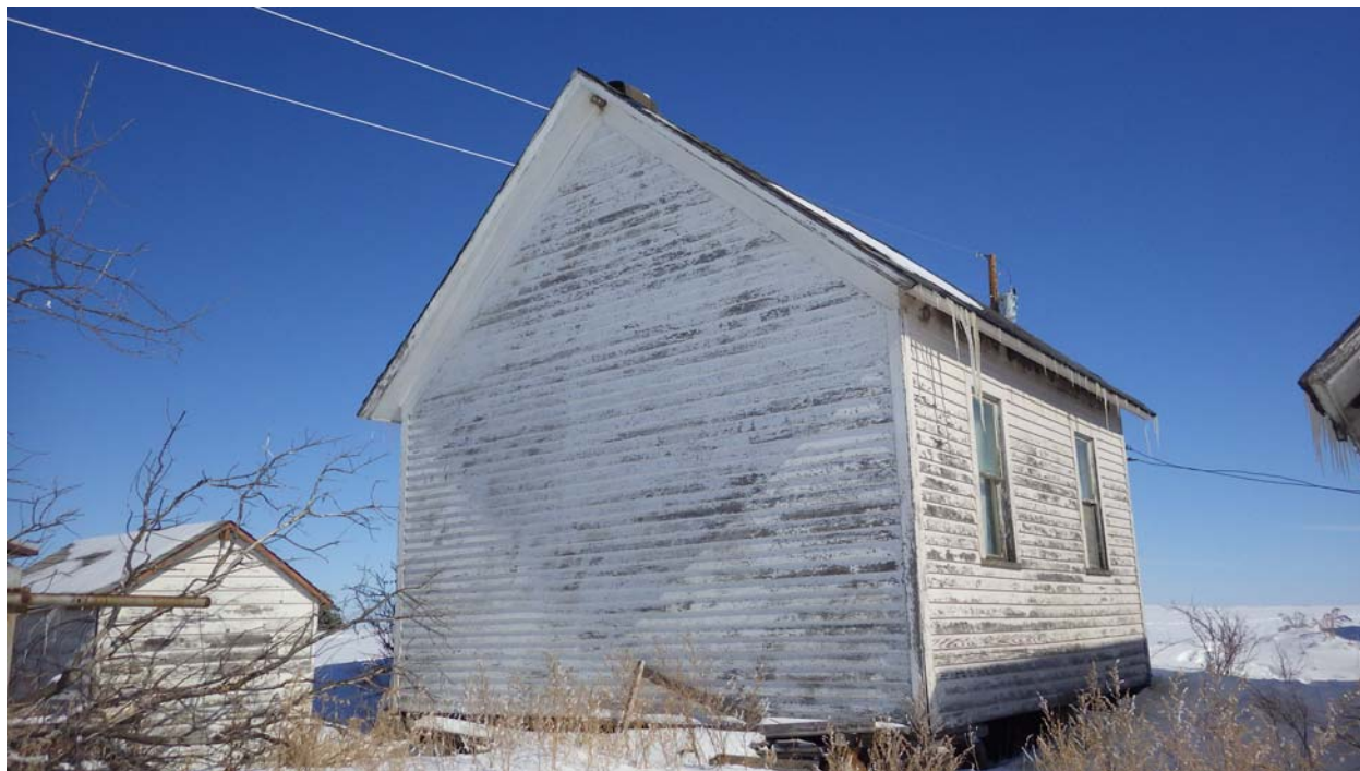
Figure 5: Site MAC-112, Feature 2, view northeast (Image 108-533).