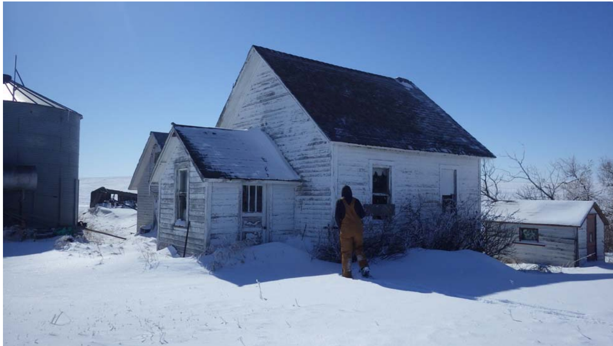
Figure 4: Site MAC-112, Feature 2, view southwest (Image 108-530).