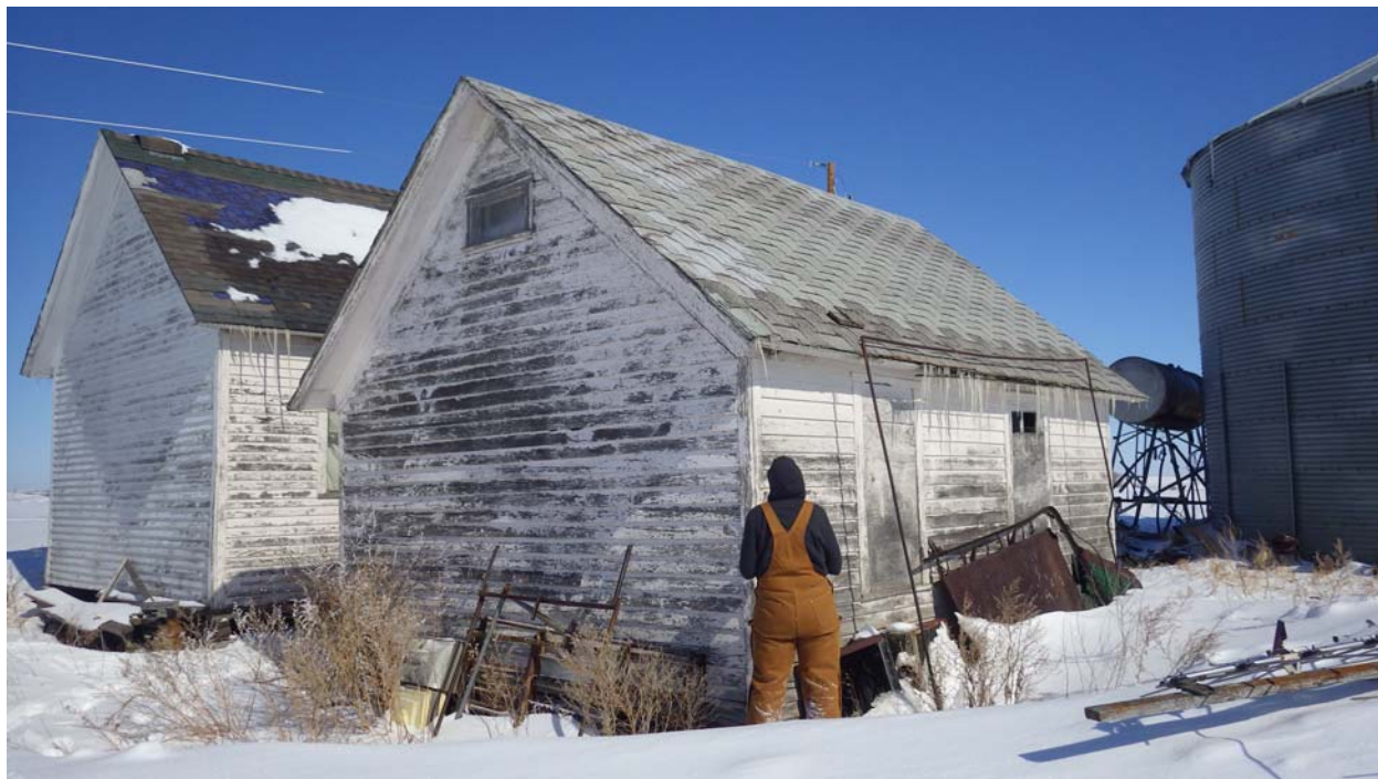
Figure 8: Site MAC-112, Feature 4 with Feature 2 in the background, view northeast (Image 108-537).