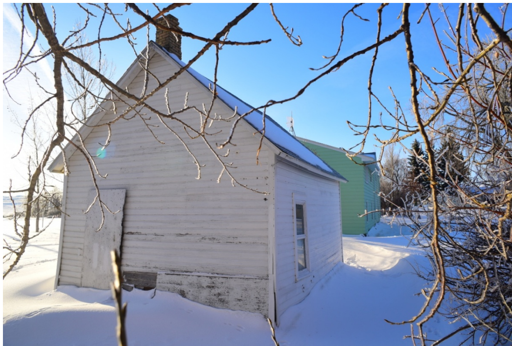
Figure 5: Site MAC-DM-17, Feature 2, view southeast (Image 6563).