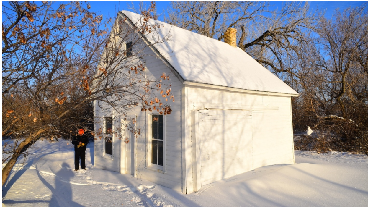
Figure 4: Site MAC-DM-17, Feature 2, view northwest (Image 6559).