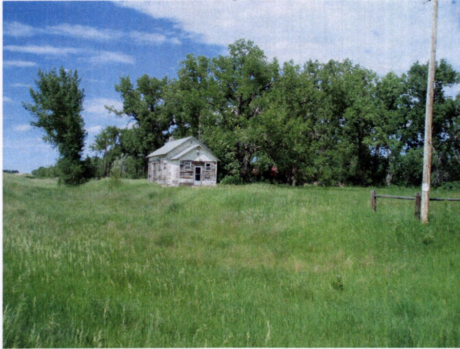
[Overview of site SCWD09-1, the Boyd school; view from the NE (SC09-DC73)]