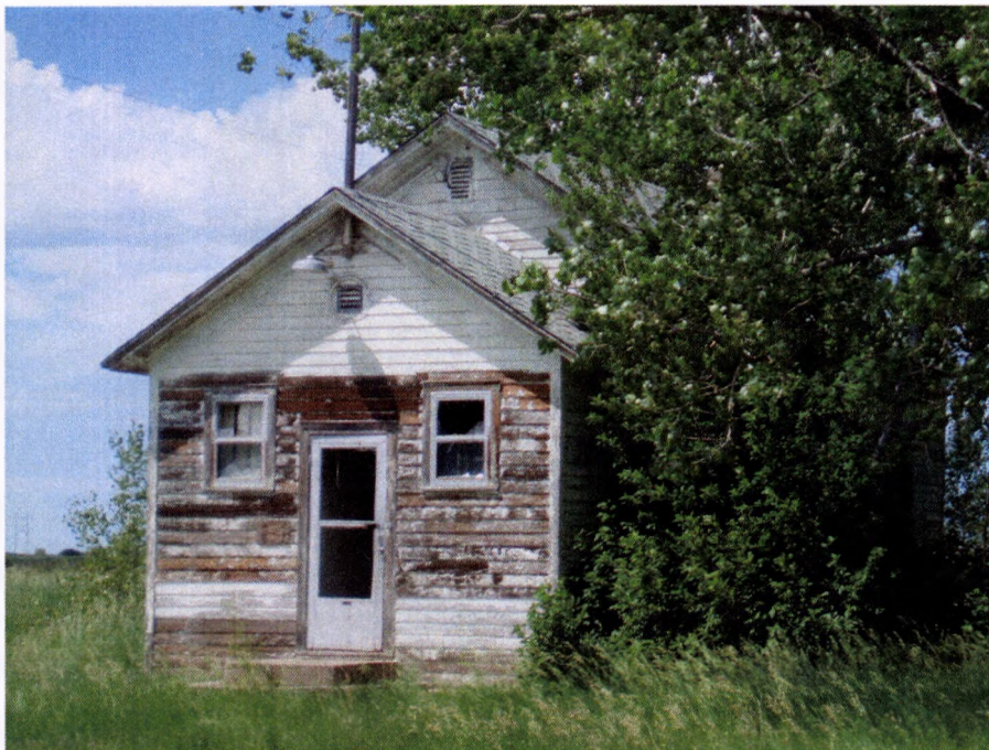
[Close up of Boyd school, view from the NNW (SC09-DC67)]