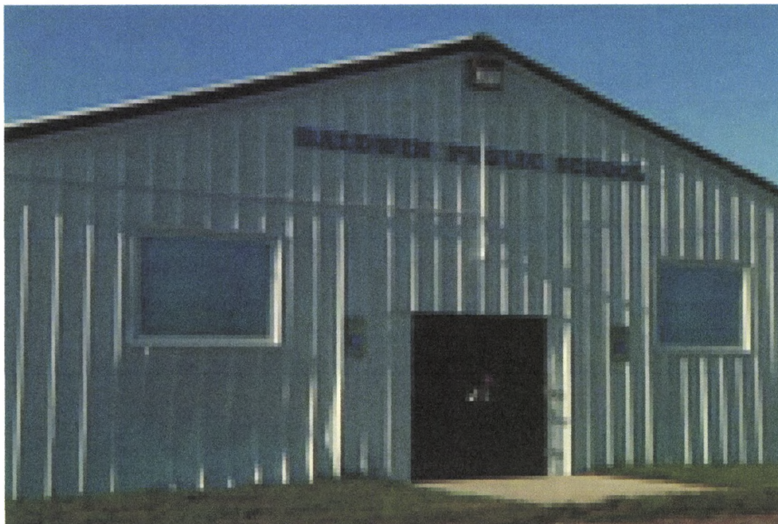
South of newer section, from school website