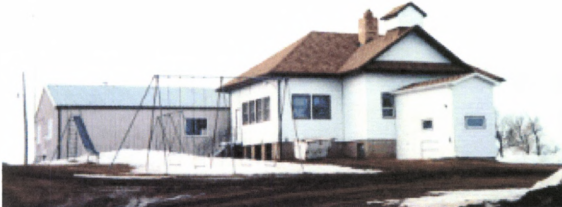
Southeast corner, from school website

Complete one Attachments Section for the entire site. Include: Topographic map (with quad name and legal description ), sketch map, photographs, and any other attachments.