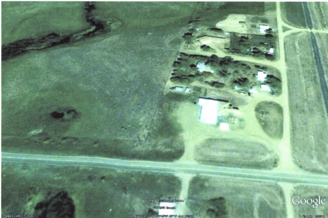
aerial oriented north-south

Recorded By Lorna Meidinger (First Name & Last Name)