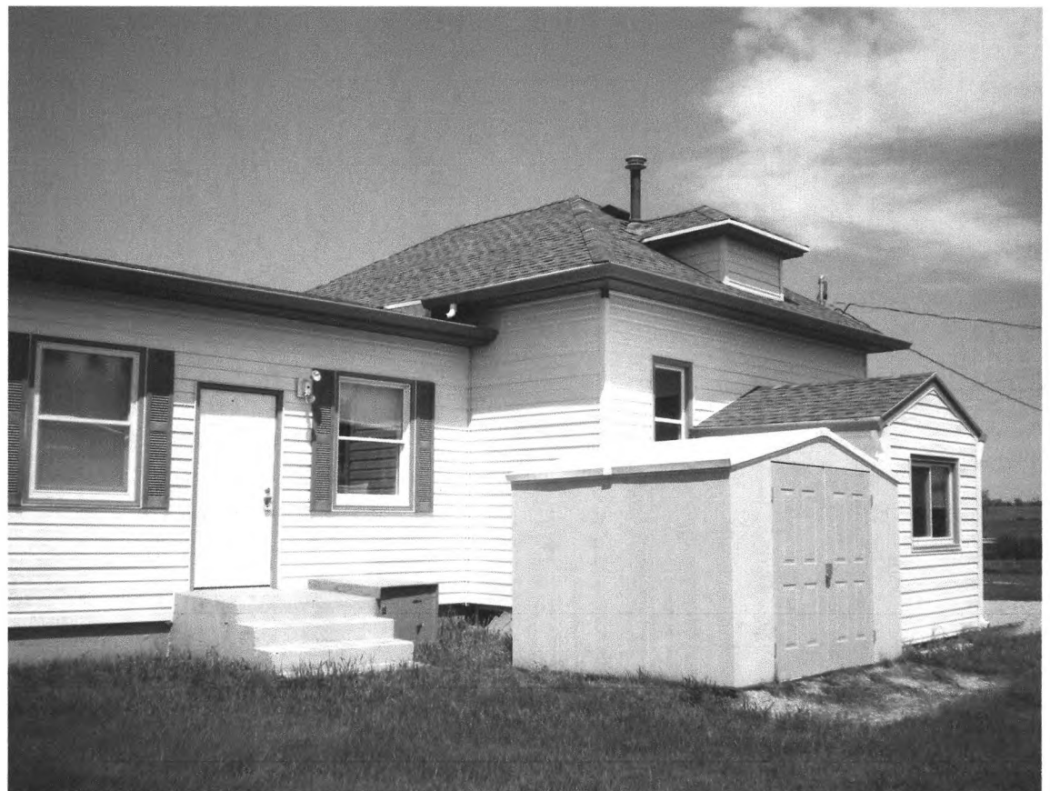
South Side - More easterly