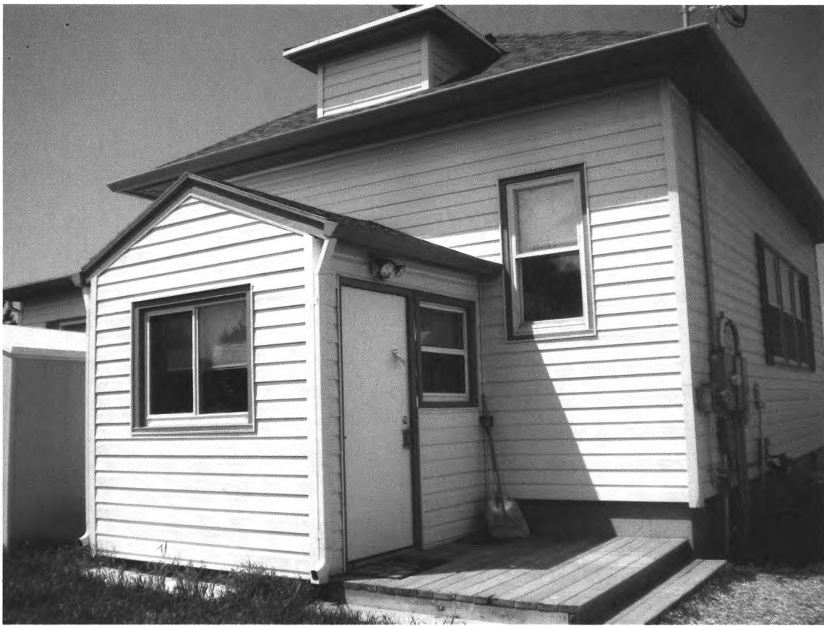
South side - east end