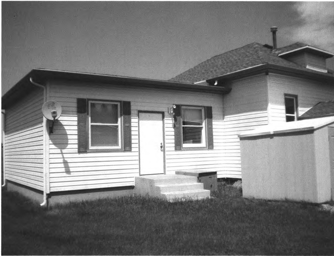
South side - West door