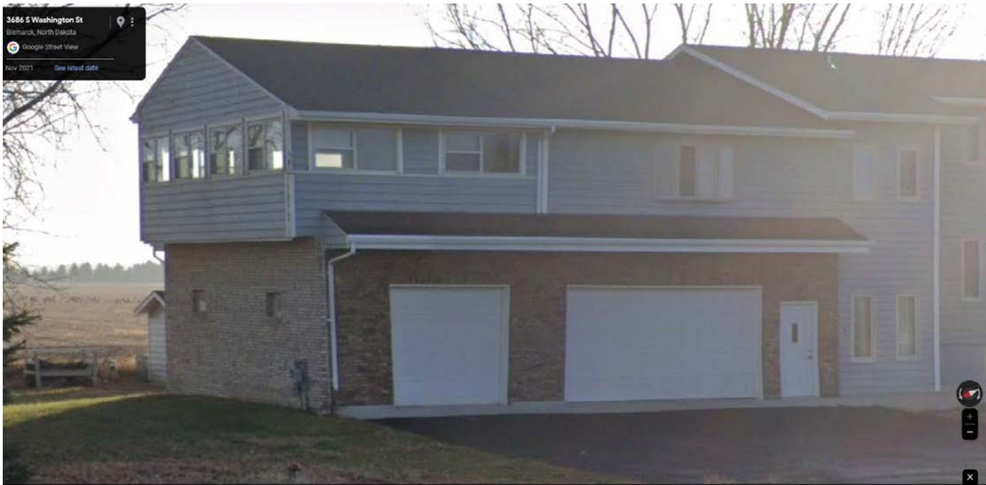
Image from Google Street View November 2021, notice windows on the east are visible from this view.

Recorded By: Lorna Meidinger Date Recorded: 3/25/2024