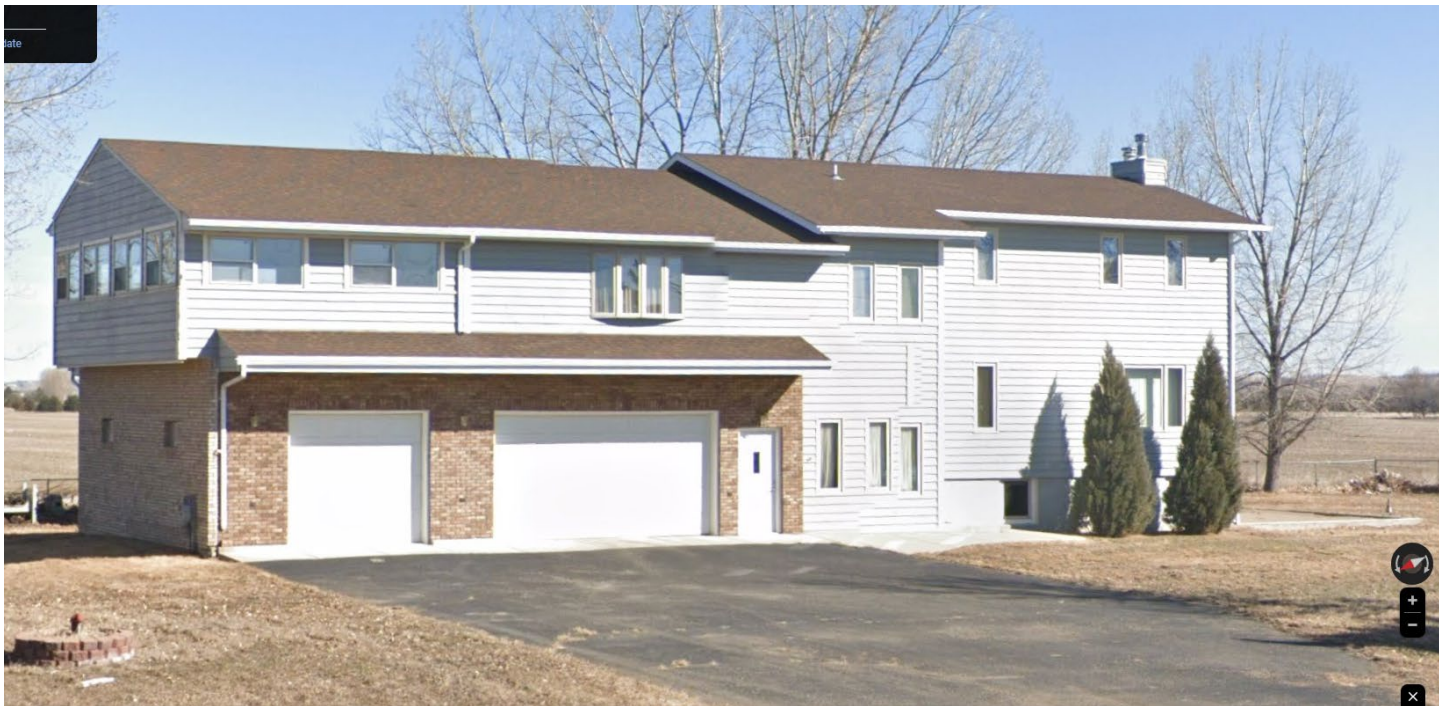
looking ESE