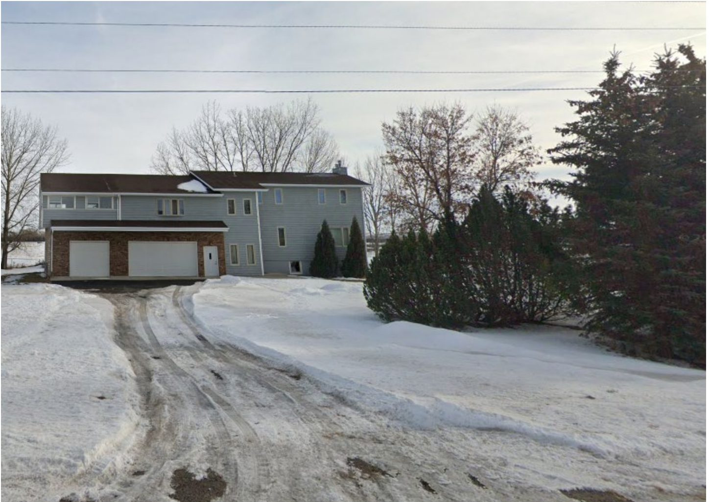
Image from Google Street View December 2022, looking east, the school is the portion on the right of the image.

Recorded By: Lorna Meidinger Date Recorded: 3/25/2024