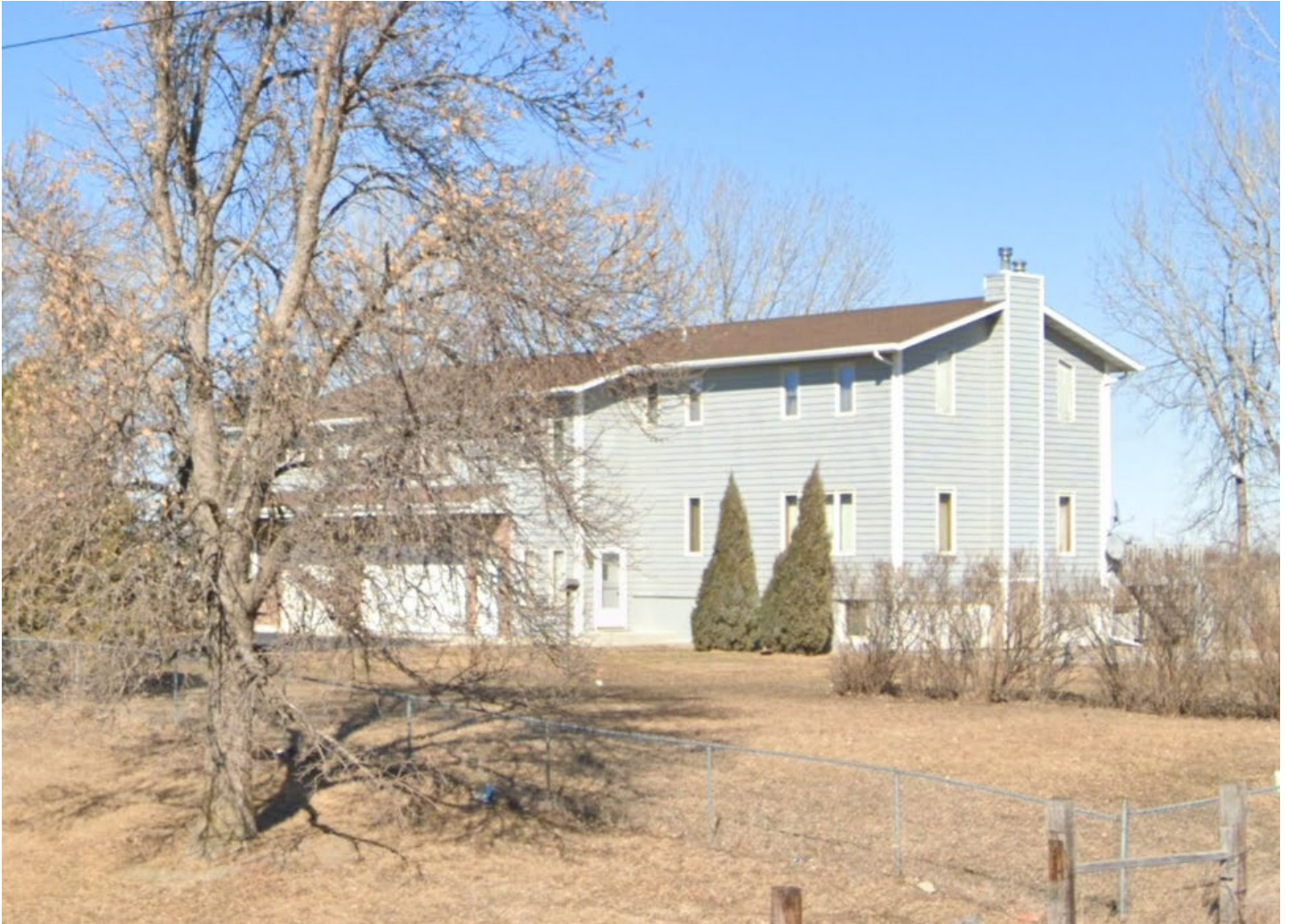
Image from Google Street View March 2022, looking northeast, showing the end that was the school.