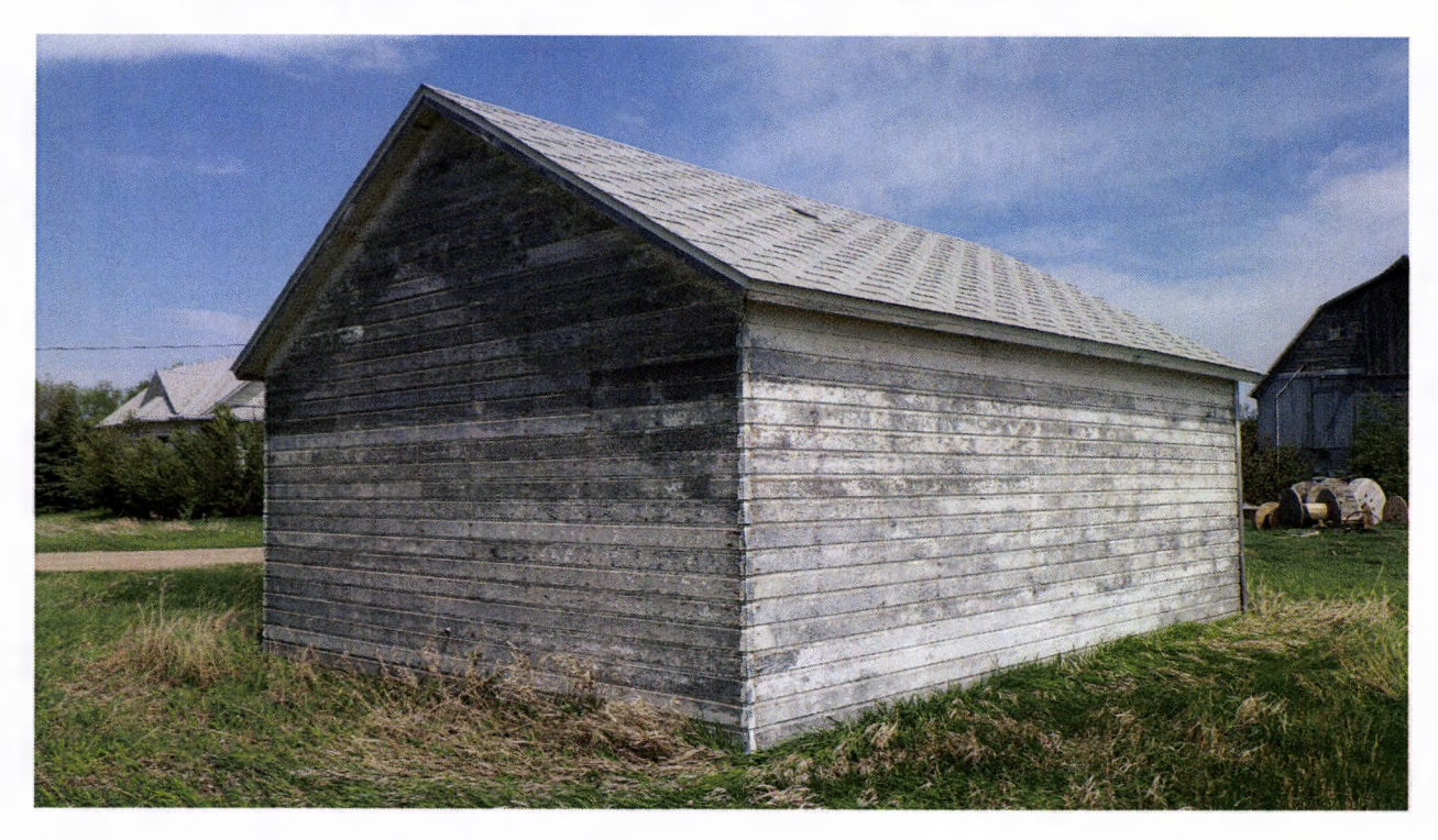
Figure 2: View to the northeast over MAC-NB-4x (Image 2816).