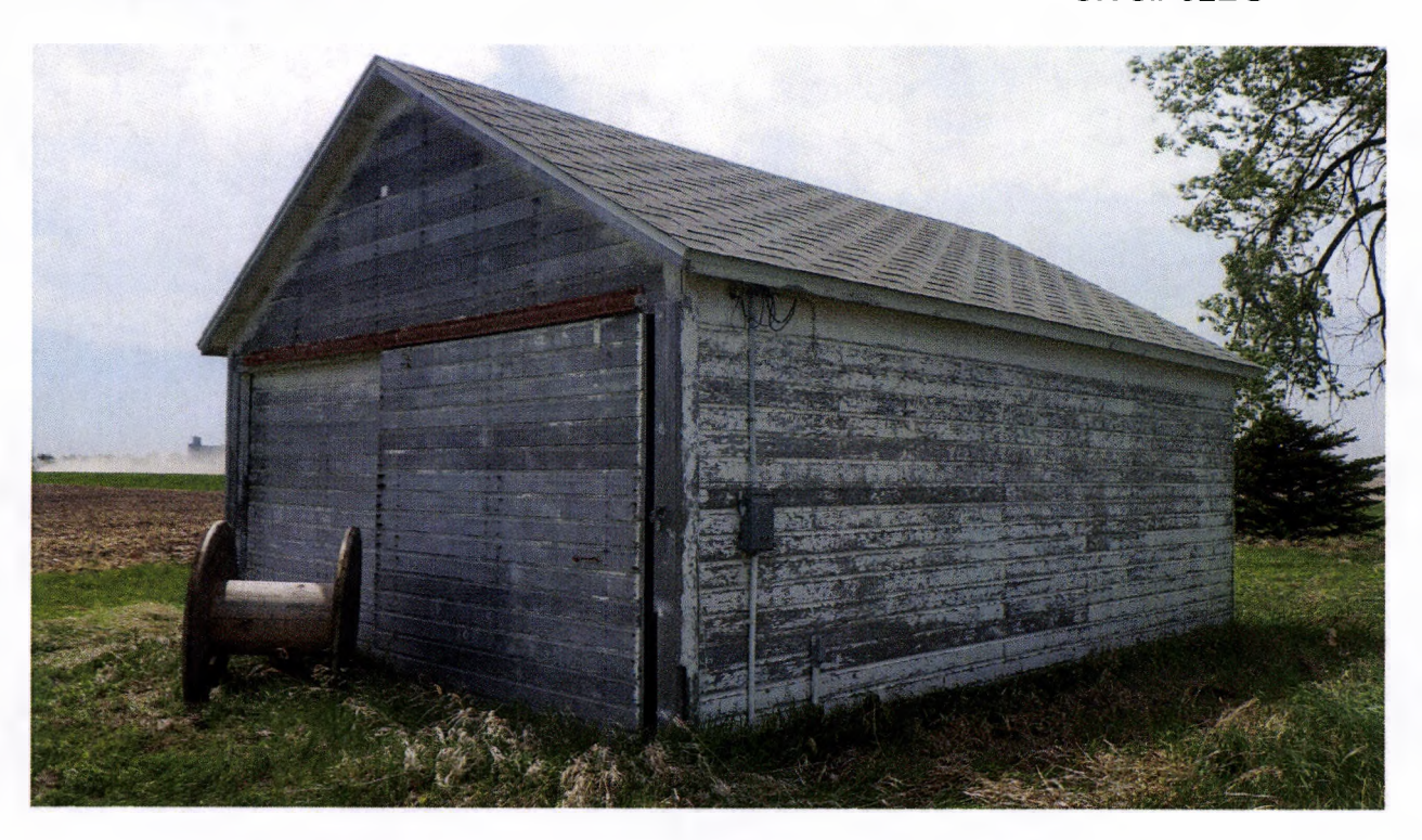
Figure 1: View to the southwest over MAC-NB-4x (Image 2815).