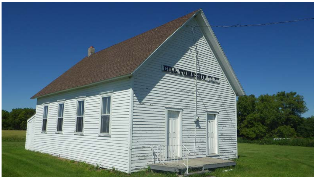
Figure 2: View northeast over southwest corner (Image #23).