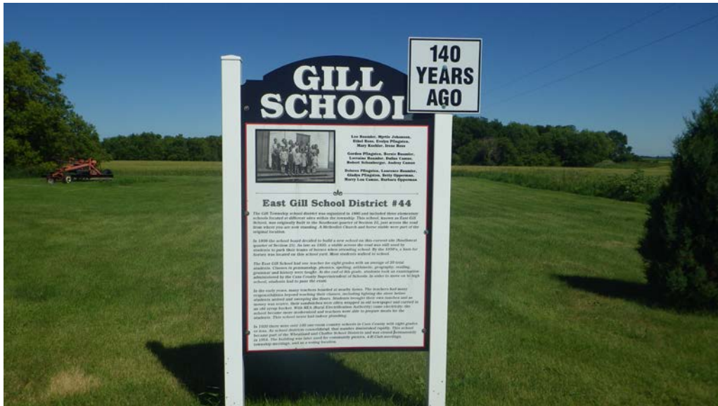
Figure 6: View east over sign (Image #16).