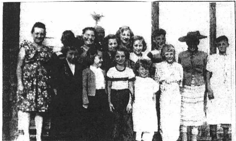
East Gill School Dist. #44, No. 1, Dress up Day, 1952.

township. Some school records are still preserved there. The building is structurally sound and is one of the last one-room schools still standing and being used in Cass County.