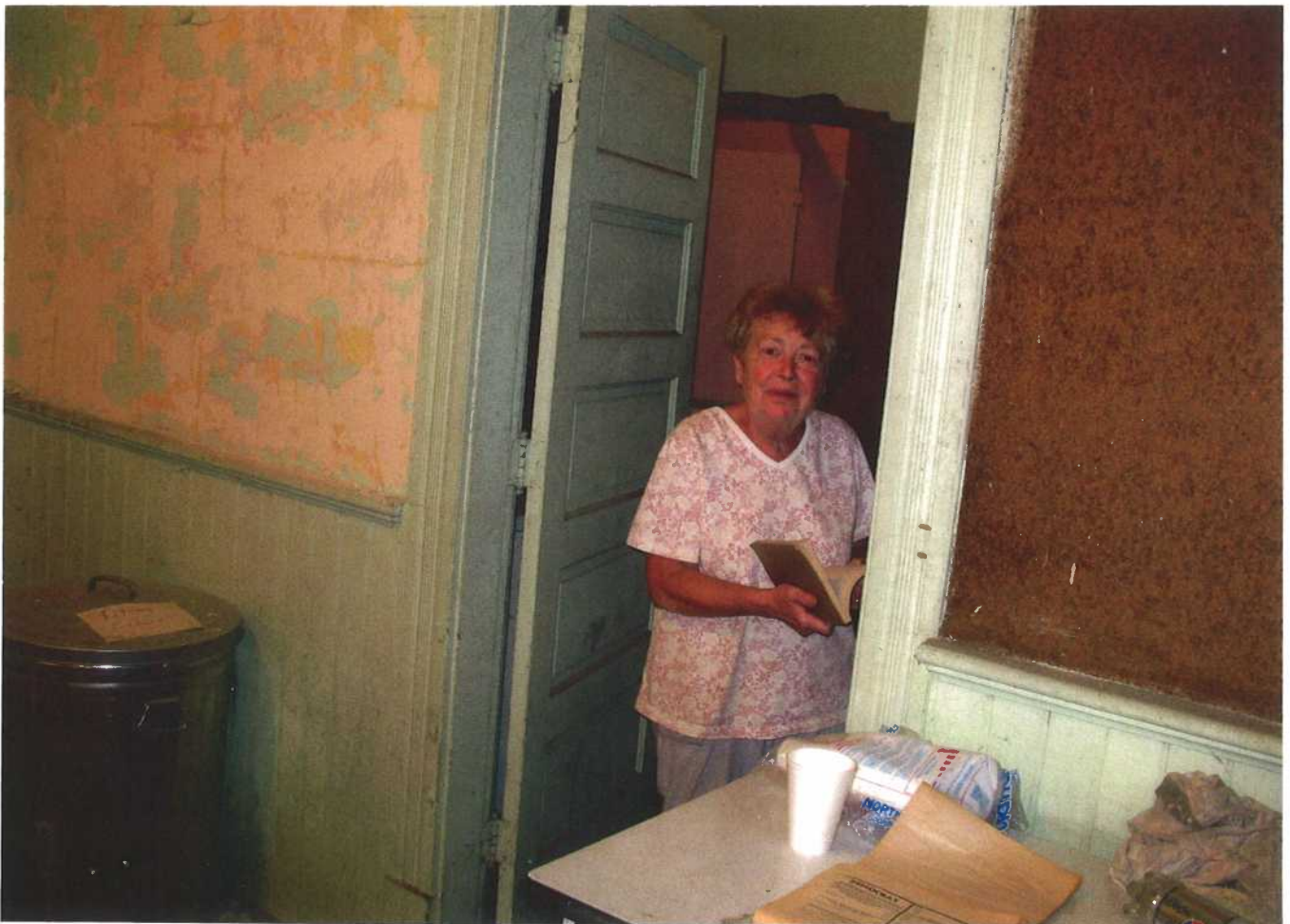
South Wall, Kitchen - Walls to be Scraped