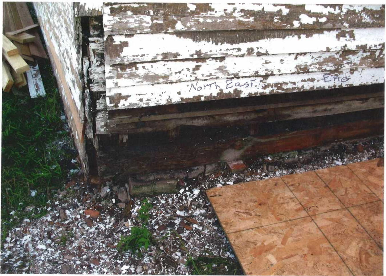
North East Corner