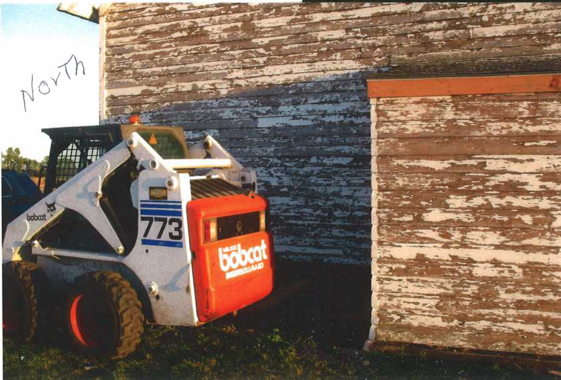
North Side Scraped