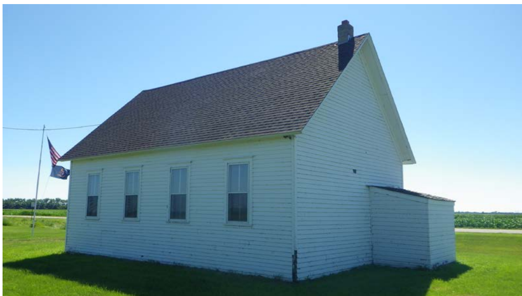
Figure 4: View southwest over northeast corner (Image #26).