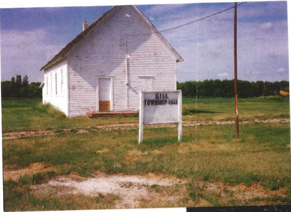
Front of East Gill School Facing South