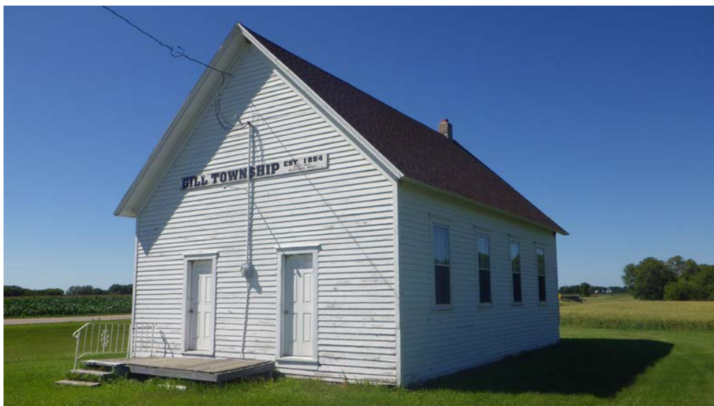
Figure 3: View northwest over the southeast corner (Image #24).