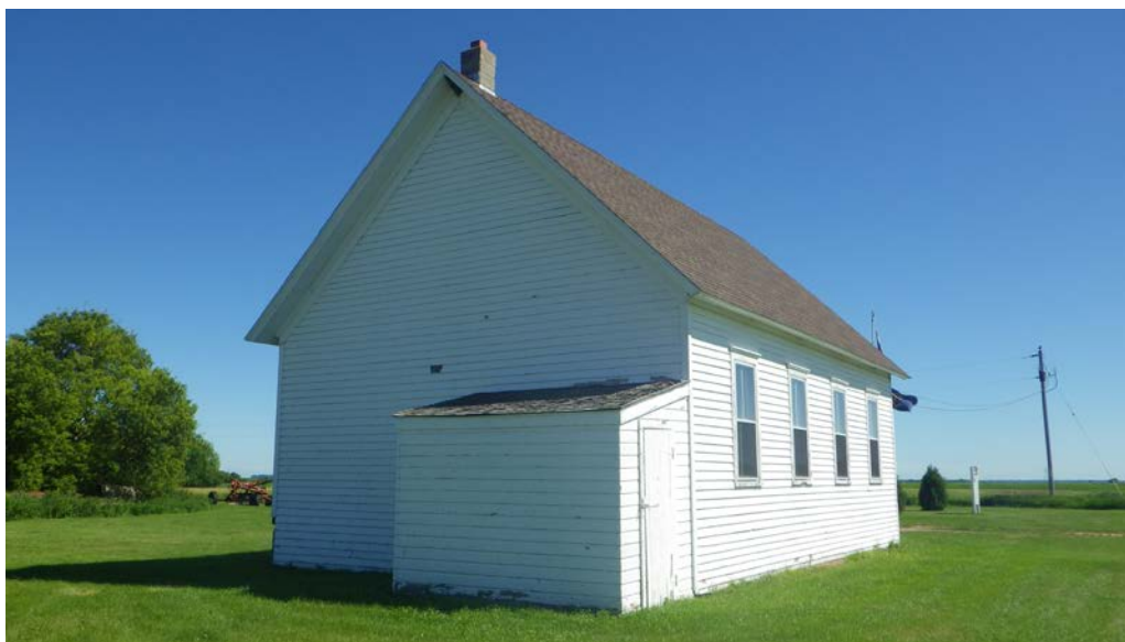
Figure 5: View southeast over northwest corner (Image #29).