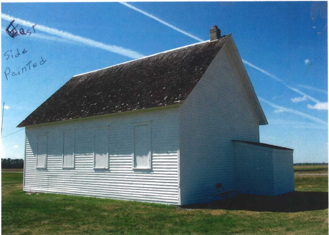
East + North Painted