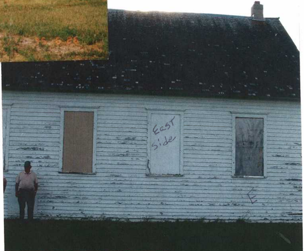
Beginning - East side