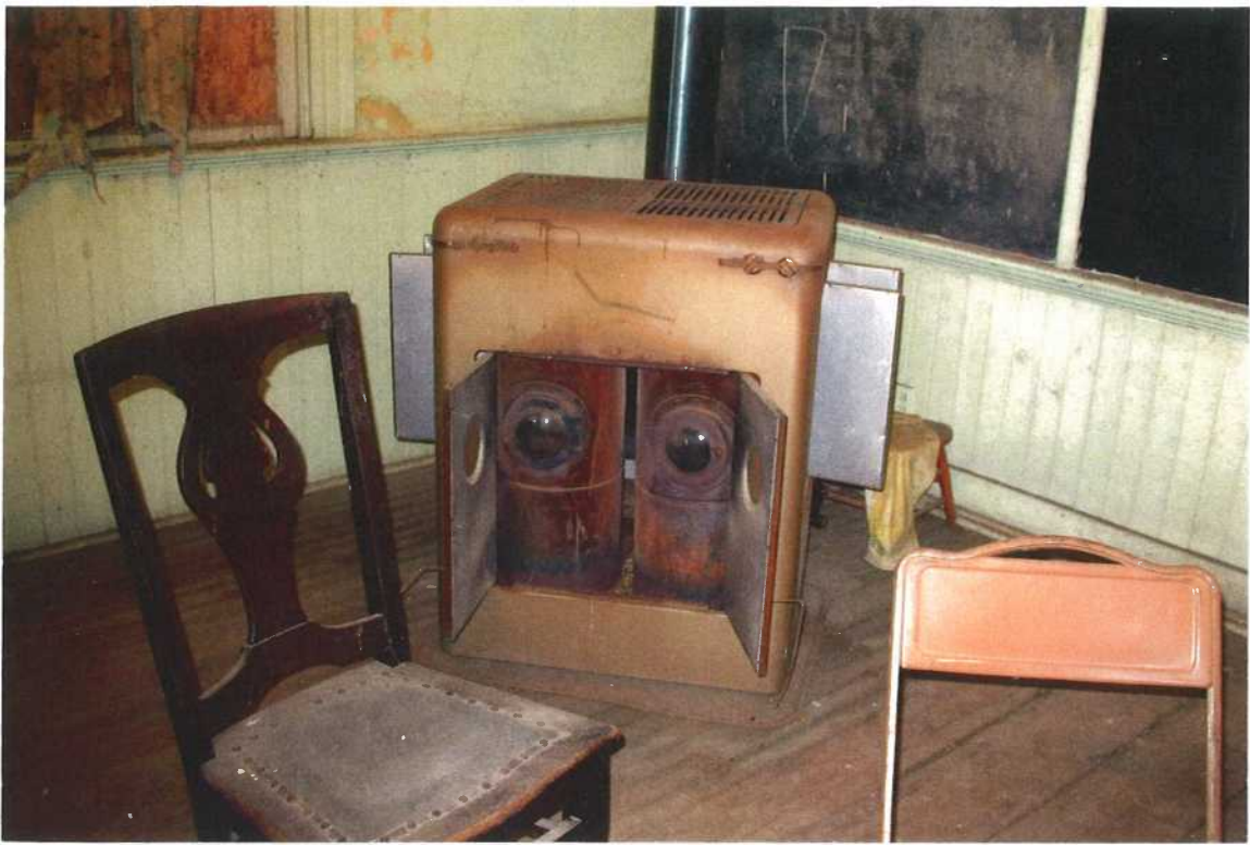
North West Wall Windows - West Stove