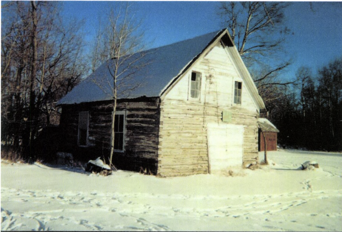
feature 2, SE