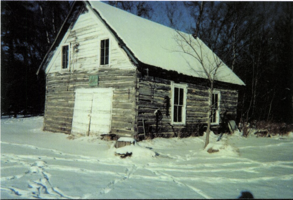
feature 2, NE

Recorded By Lorna Meidinger (First Name & Last Name)