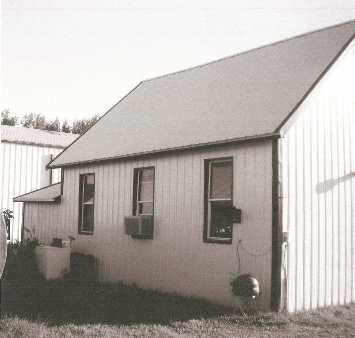
West and South Sides