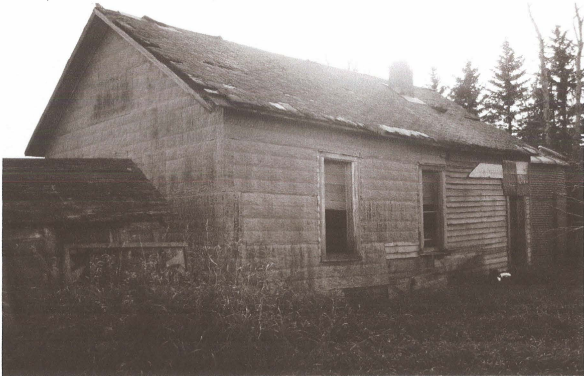
South End and North Side