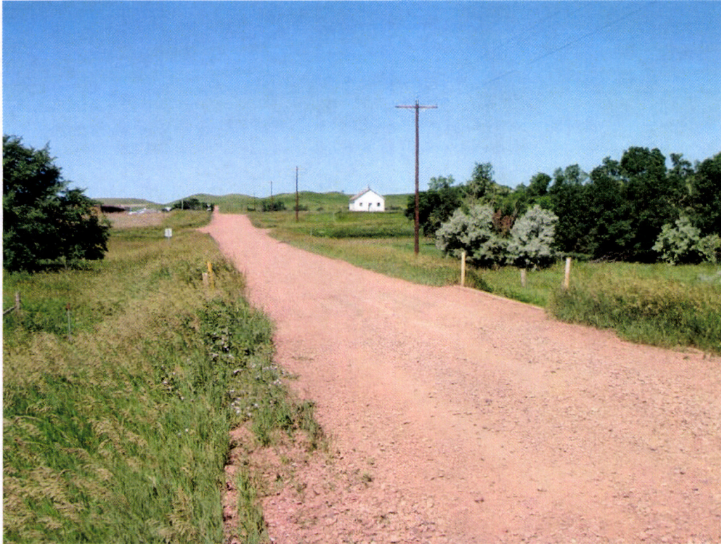
Site overview (View WNW; UW2582-119).