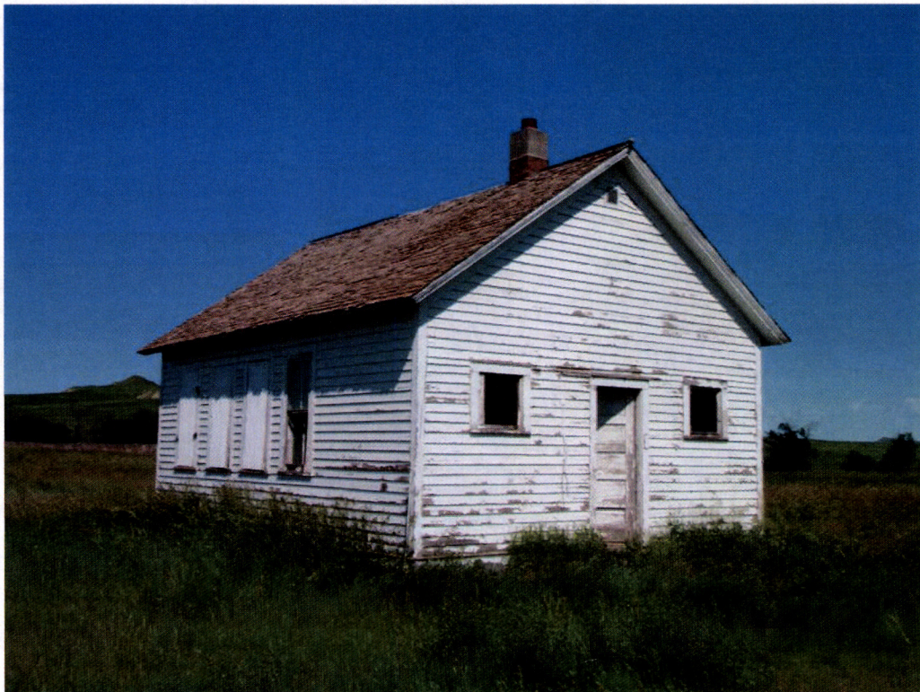
Feature 1 schoolhouse, front-side oblique view (View NW; UW2582-099).