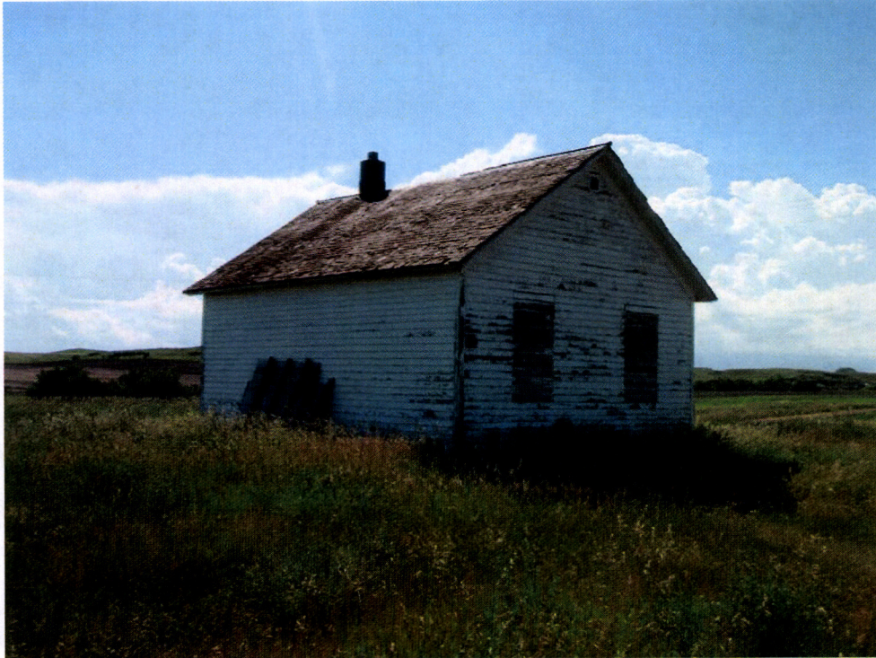
Feature 1 schoolhouse, rear-side oblique view (View SE; UW2582-104).