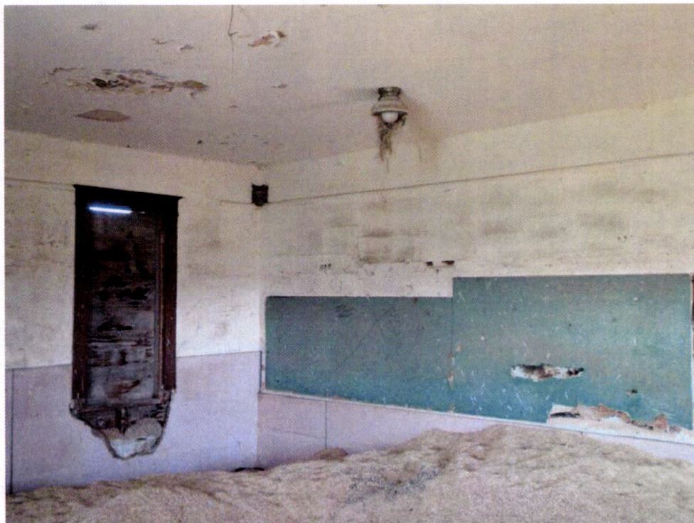
Interior of Feature 1 schoolhouse. West and north walls with chalkboard and boarded-up window. (View NW; UW2582-088).

Recorded By: Megan Lonski & Mike Jackson Date Recorded: 09/13/2011