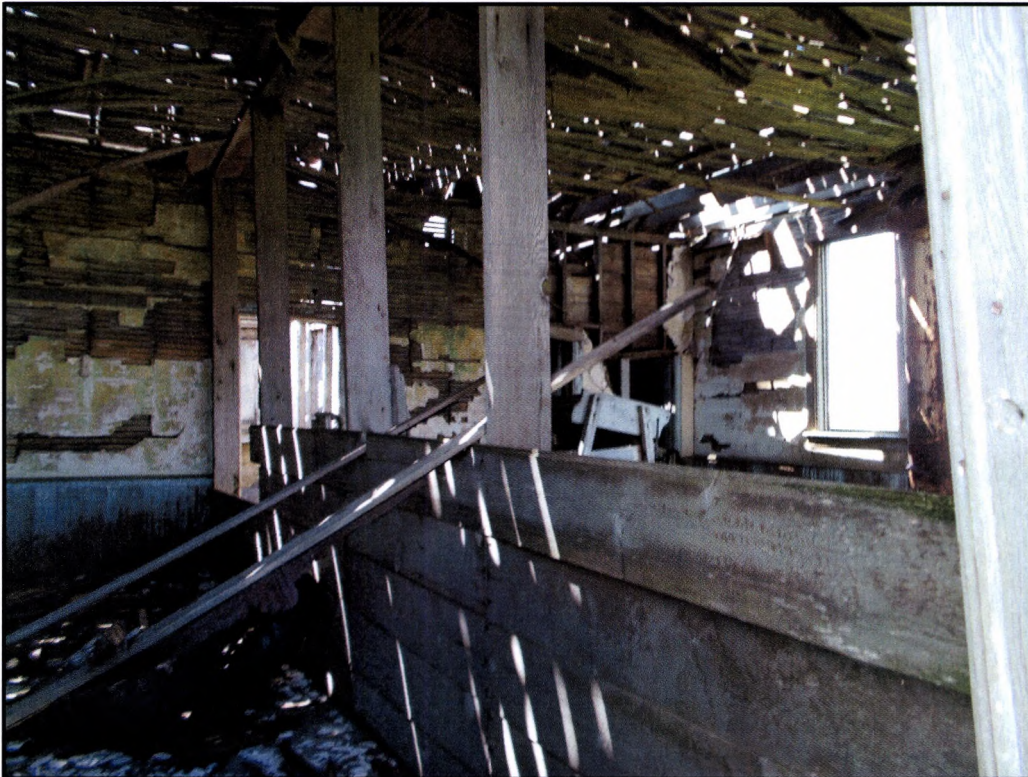
Figure 18: Additional interior of Feature 3.

Recorded By Ryan Swanson (First Name & Last Name)