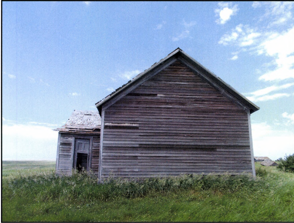
Figure 15: Feature 3's north elevation.