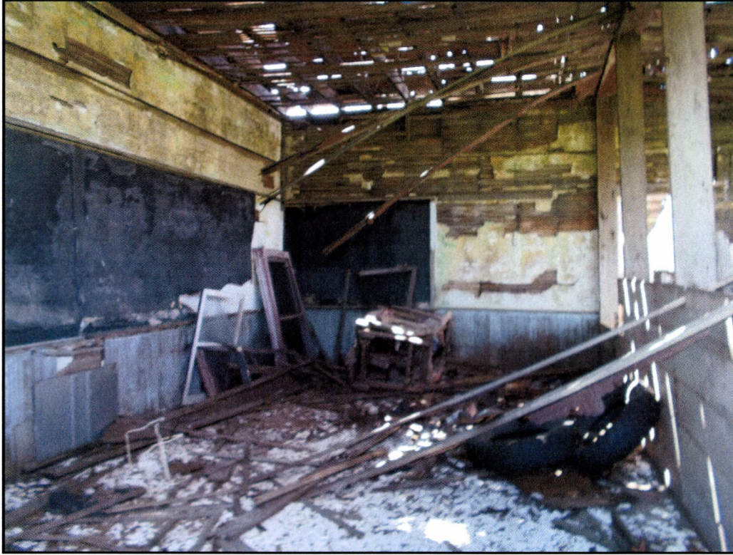
Figure 17: Interior of the former schoolhouse. Note chalkboards, deteriorating lathe and plaster, and wood-frame partition which is likely to have been constructed at a later date.