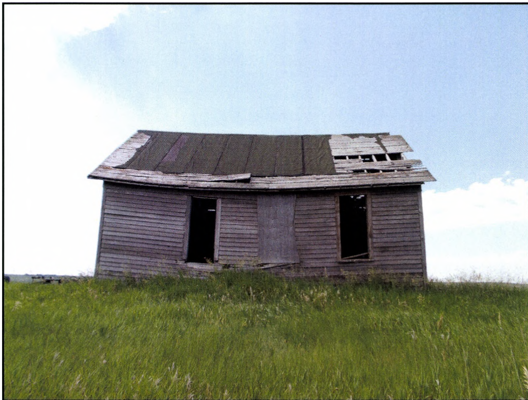
Figure 16: East elevation of Feature 3.

Recorded By Ryan Swanson (First Name & Last Name)