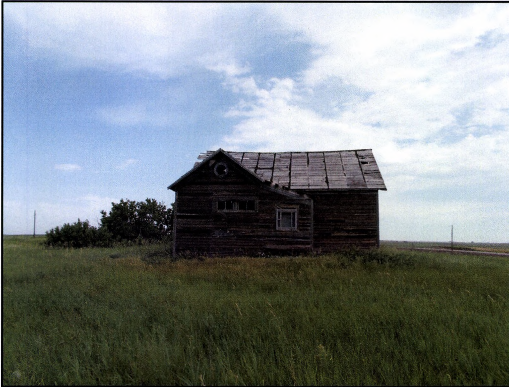
Figure 13: The south elevation of Feature 3. Evidence that the original schoolhouse entrance has been infilled and a shed (lean-to) foyer added to accommodate the new, east-facing door is visible.