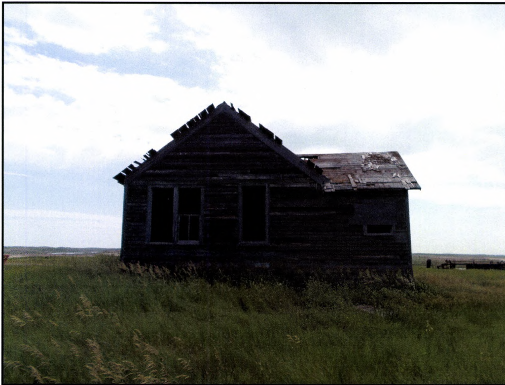
Figure 14: West elevation of Feature 3.

Recorded By Ryan Swanson (First Name & Last Name)