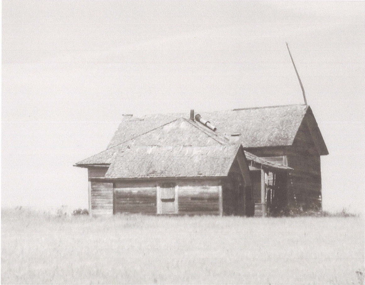
South Side (Smaller shed south of the school)