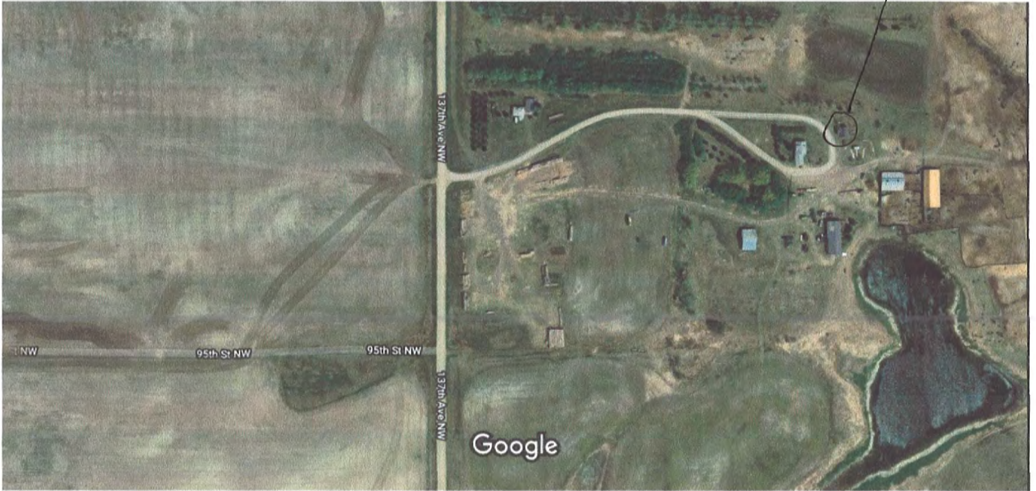
Imagery ©2019 Google, Map data ©2019 Google 200 ft