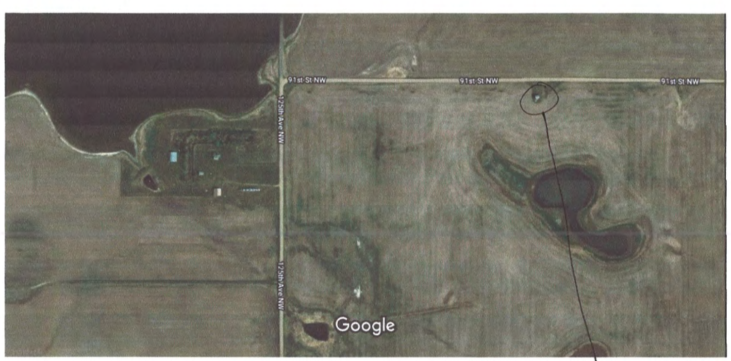
Imagery @2019 Google, Map data @2019 Google 500 ft