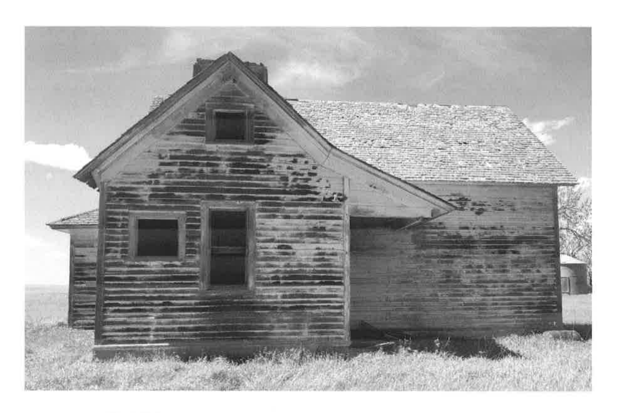
East Side Long Creek Township School 5/22/2020