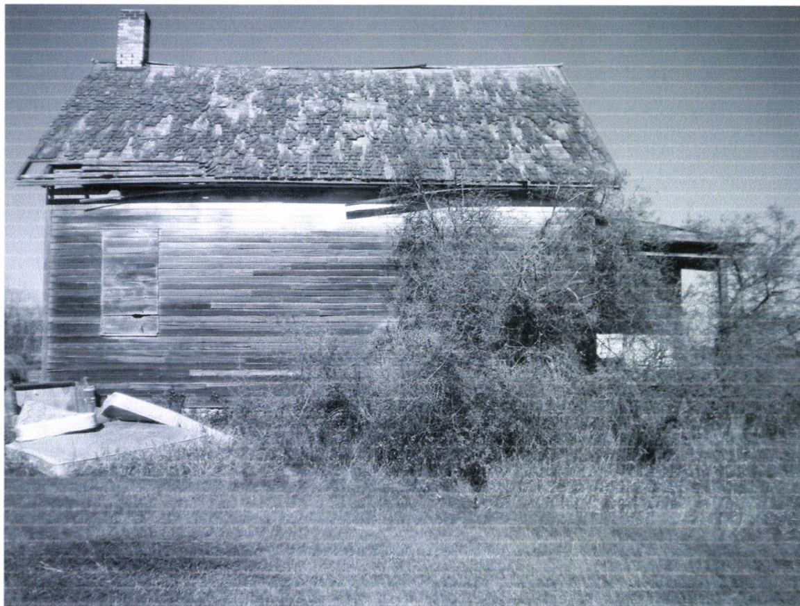
Colvin Township School 10/22/2010 South Side Kathy Wilner ED