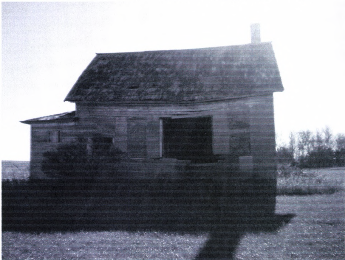
Colvin Township School 10/2/2010 North Side Kathy Wilner ED