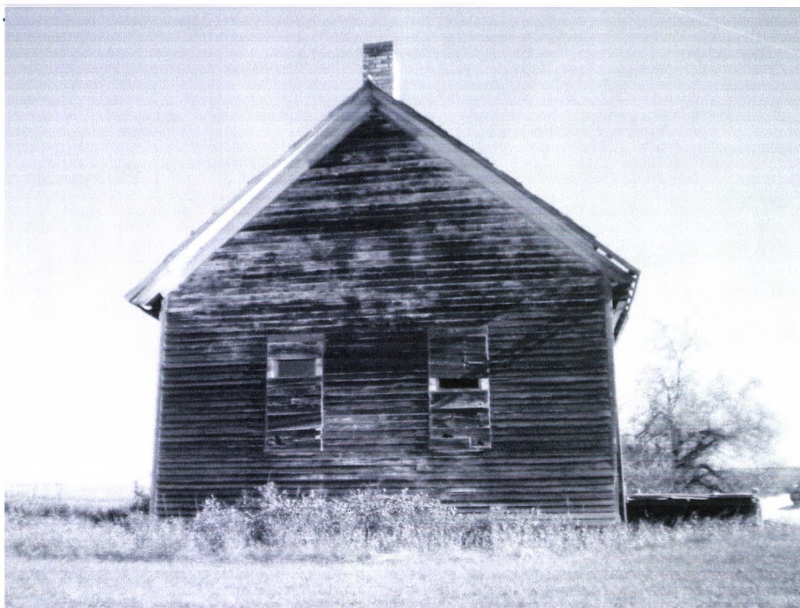
Colvin Township School 10/22/2010 West Side Kathy Wilner ED