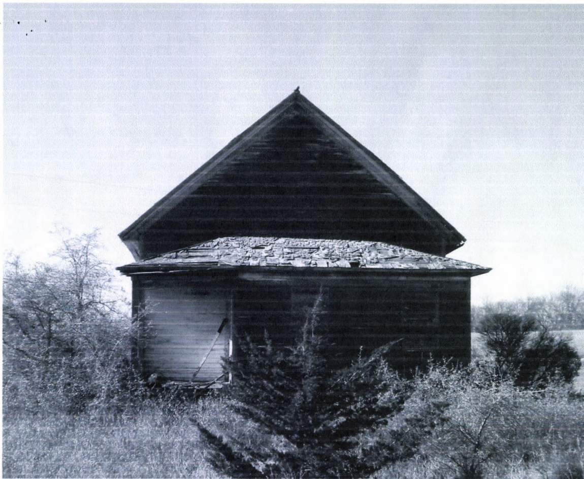
Colvin Township School 10/22/2010 East Side Kathy Wilner ED