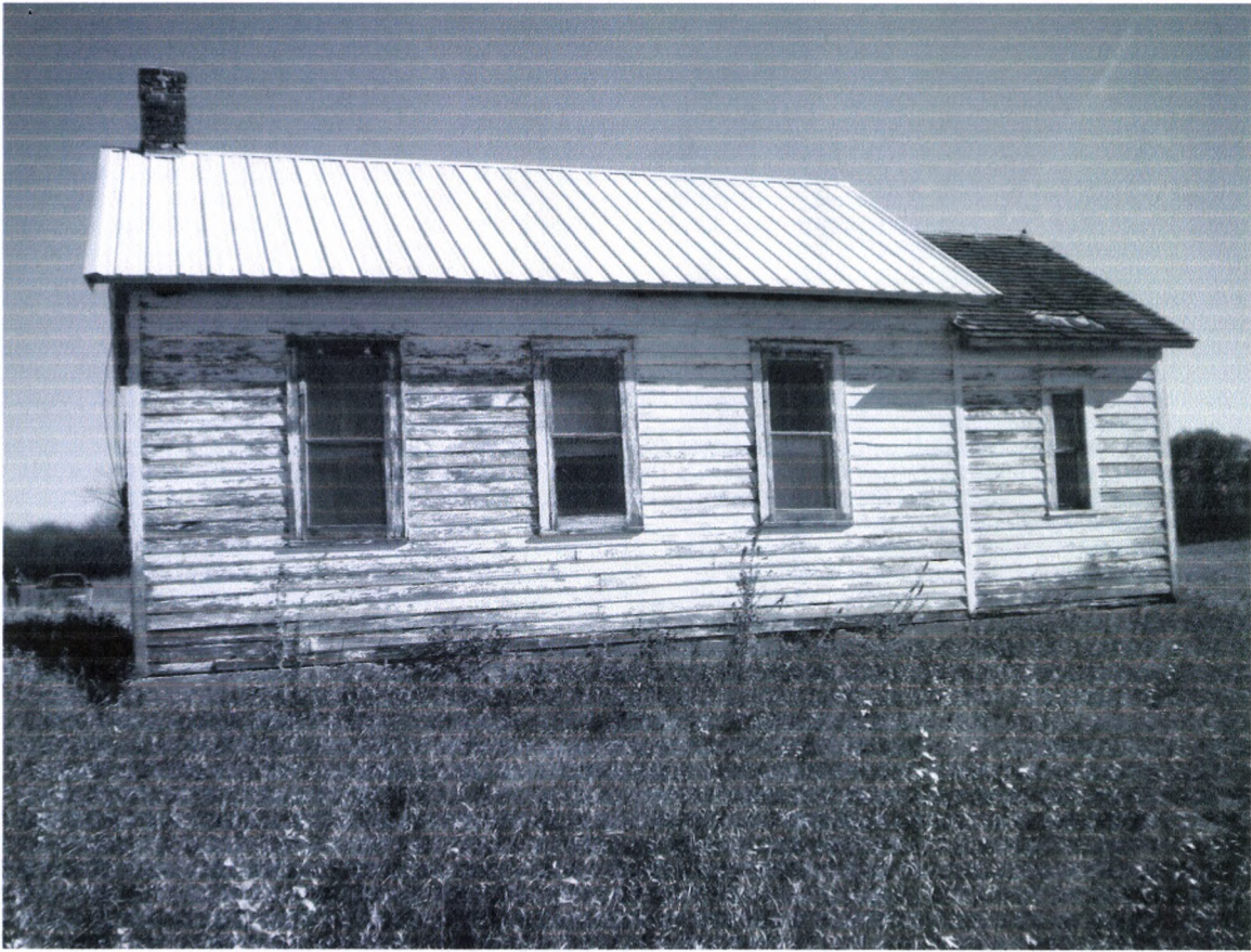
Paradise Township School 10/22/2010 West Side Kathy Wilner ED