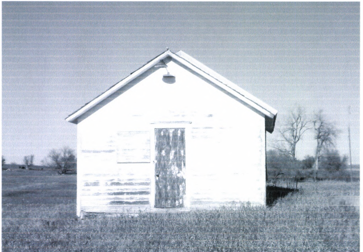
Paradise Township School 10/22/2010 South Side Kathy Wilner ED