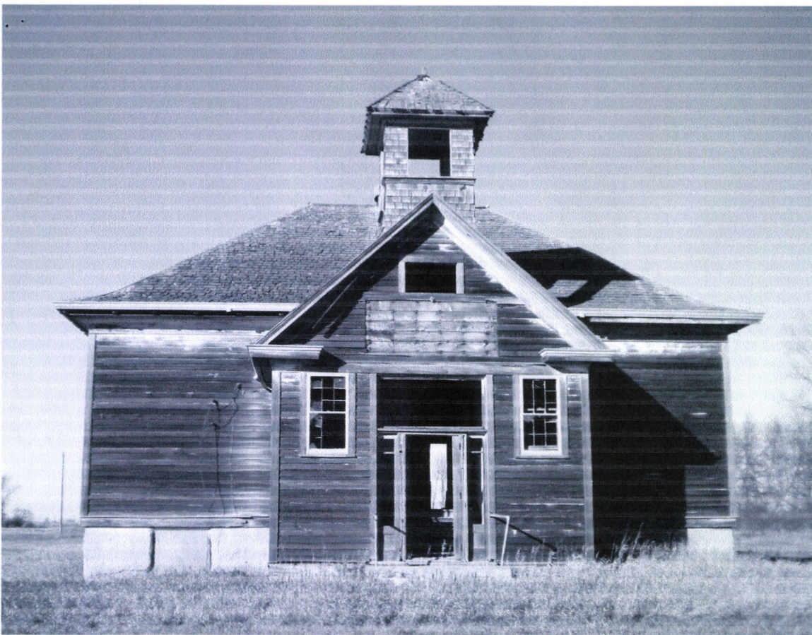
Columbia School 10/22/2010 South Side Kathy Wilner ED