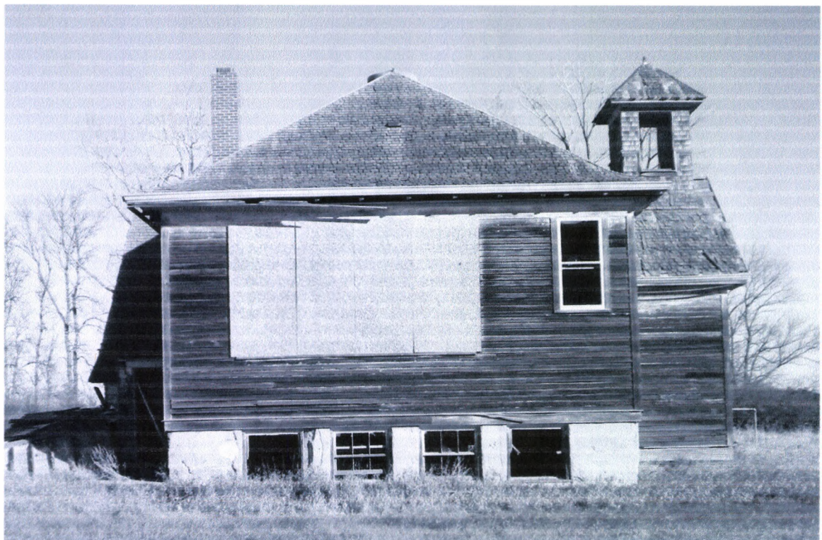
Columbia School 10/22/2010 West Side Kathy Wilner ED