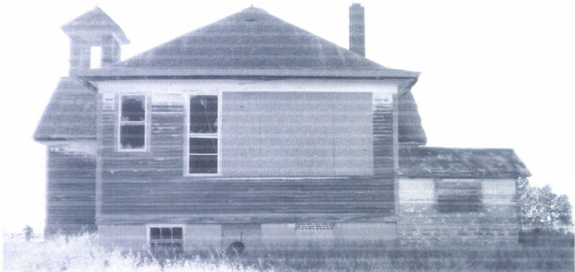
Columbia School 10/22/2010 East Side Kathy Wilner ED