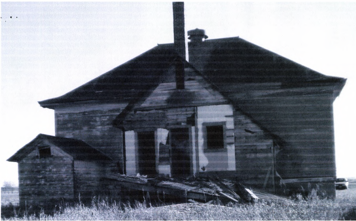
Columbia School 10/22/2010 North Side Kathy Wilner ED