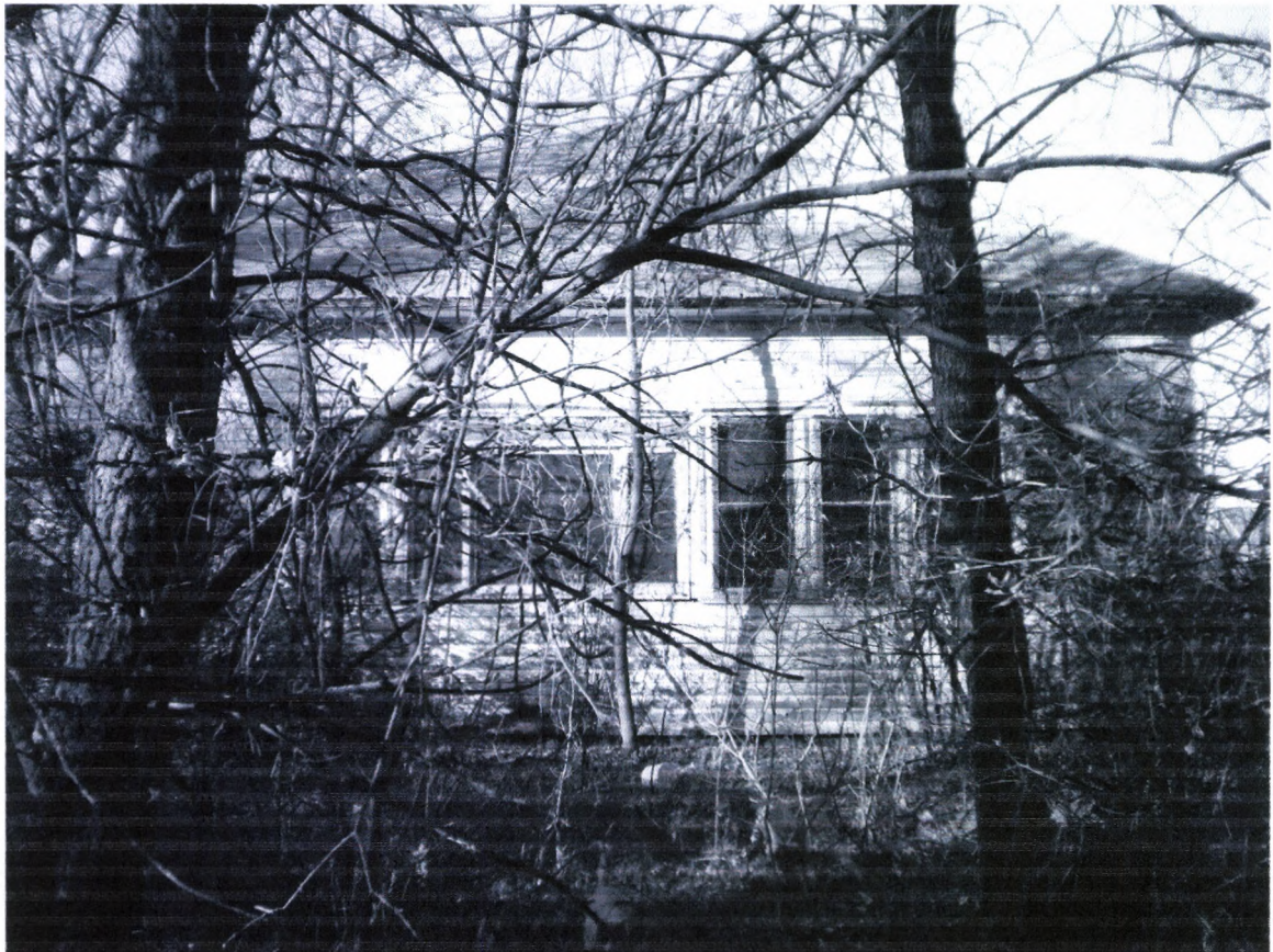
Superior Township School #1 10/22/2010 South Side Kathy Wilner ED