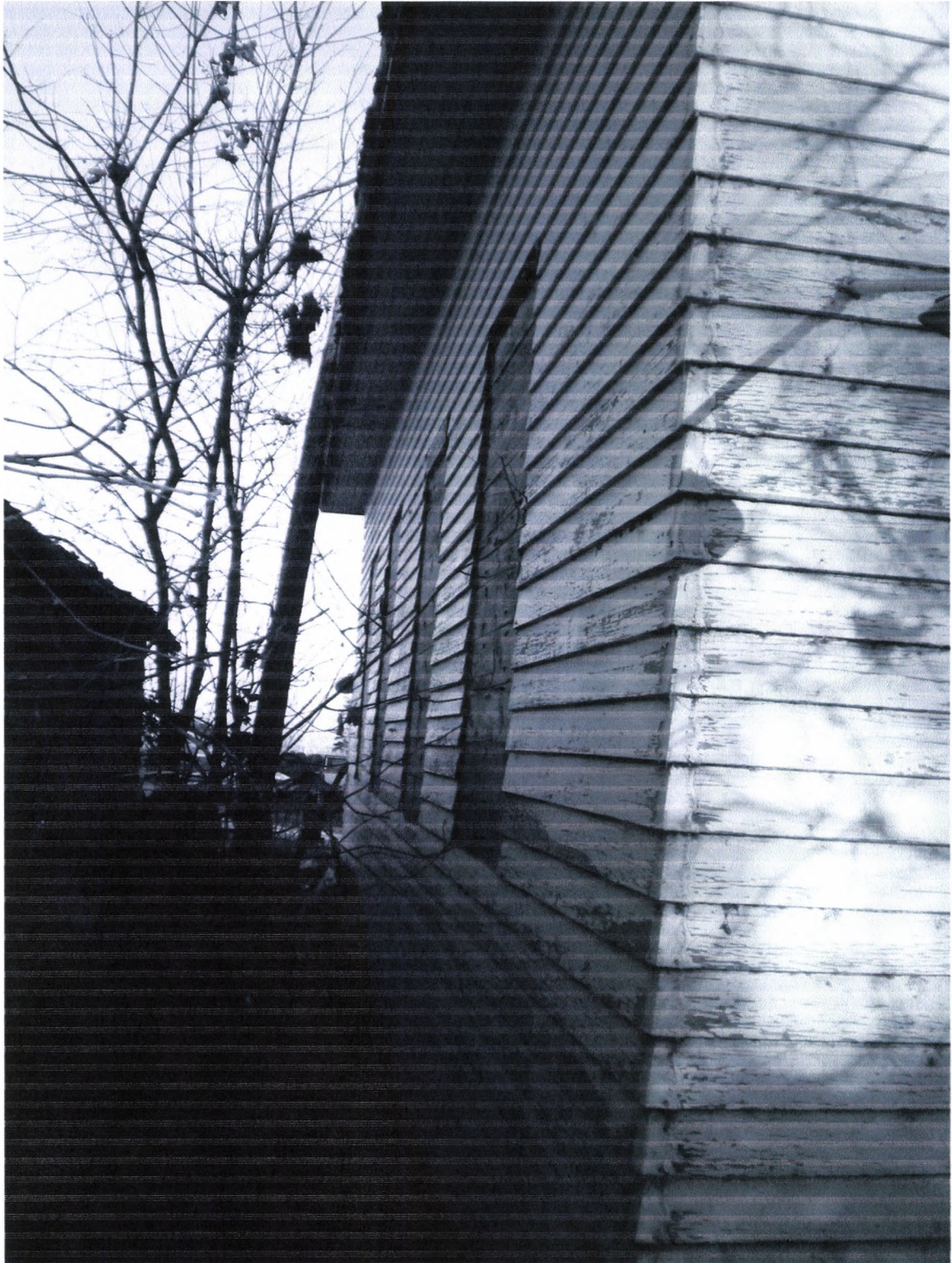
Superior Township School #1 10/22/2010 North Side Kathy Wilner ED

(The best I could do with a building right next door)