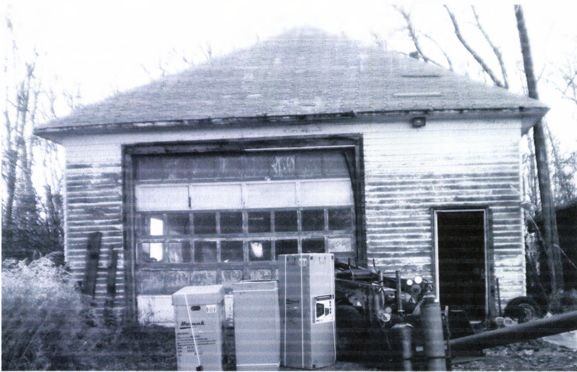
Superior Township School #1 10/22/2010 East Side Kathy Wilner ED