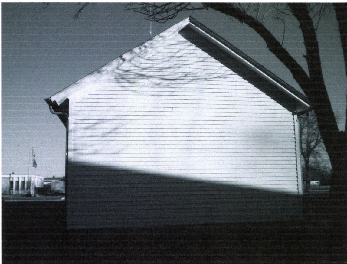
Eddy County Museum 10/22/2010 South Side Kathy Wilner ED