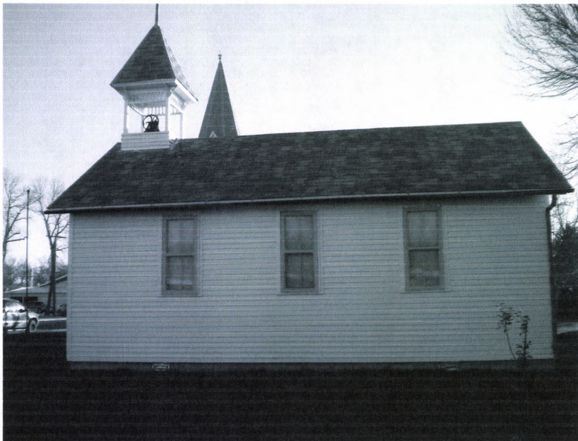
Eddy County Museum 10/22/2010 West Side Kathy Wilner ED