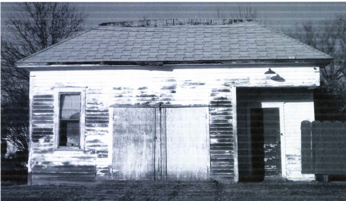
School located in New Rockford, no information about the school, 10/22/2010 East Side Kathy Wilner ED