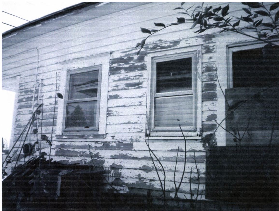
School located in New Rockford, no information about the school, 10/22/2010 North side Kathy Wilner ED