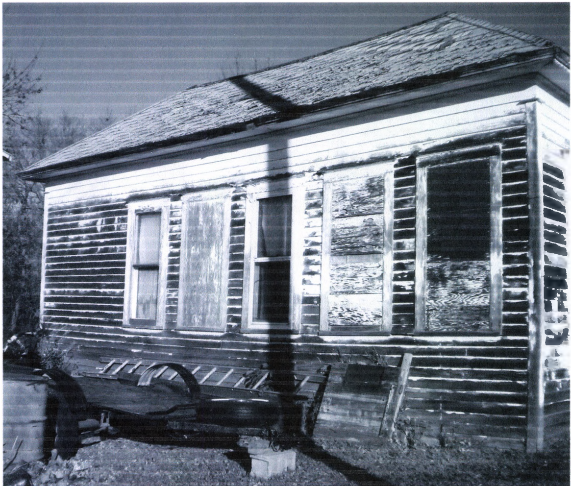
School located in New Rockford, no information about the school 10/22/2010 South Side Kathy Wilner ED