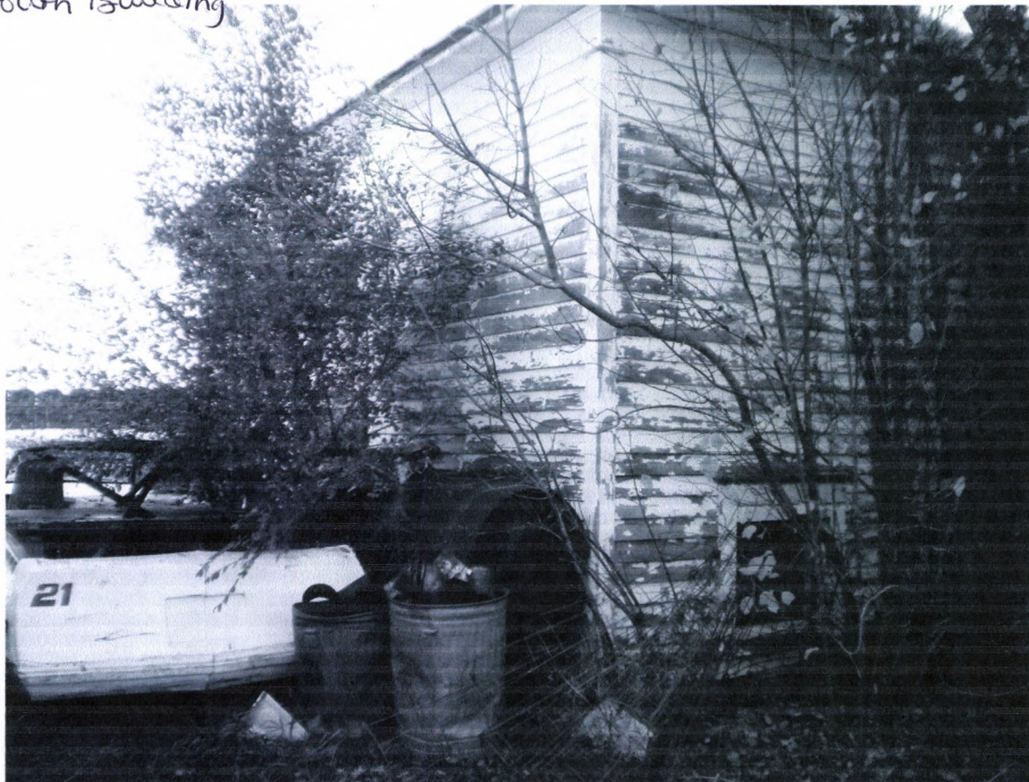
School located in New Rockford, no information about the school, 10/22/2010 North Side Kathy Wilner ED