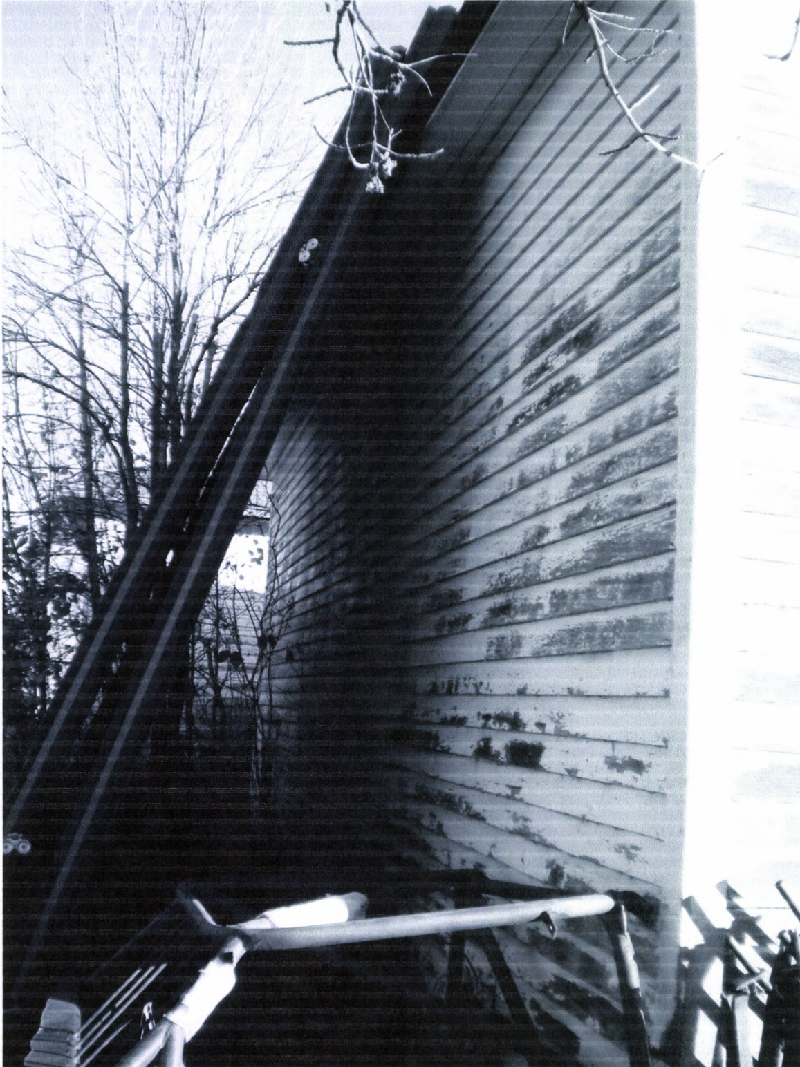
School located in New Rockford, no information about the school, 10/22/2010 West Side Kathy Wilner ED