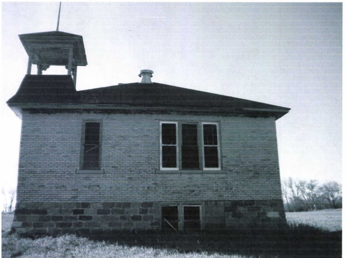
Munster Township School North Side 10/22/2010 Kathy Wilner ED