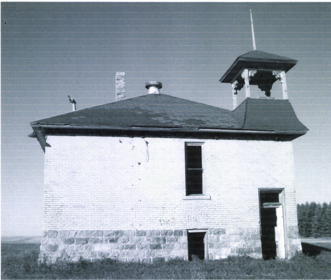
Munster Township School 10/22/2010 East Side Kathy Wilner ED