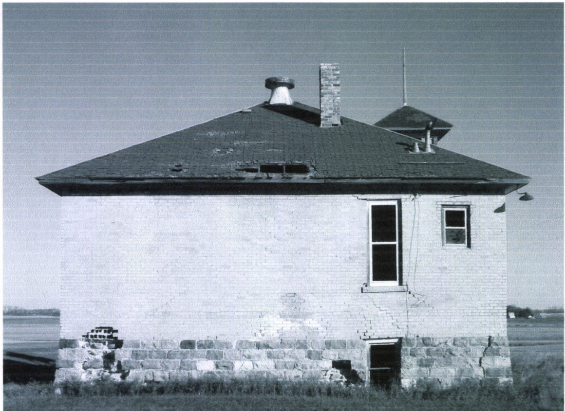
Munster Township School 10/22/2010 South Side Kathy Wilner ED