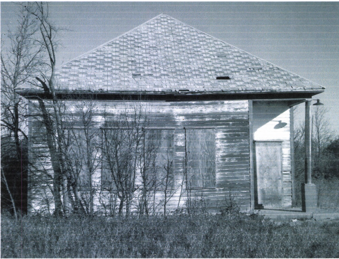
Grandfield Township School 10/22/2010 South Side Kathy Wilner ED