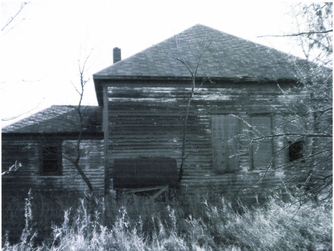
Grandfield Township School 10/22/2010 West Side Kathy Wilner ED