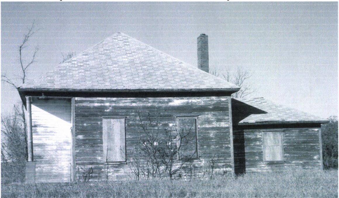
Grandfield Township School 10/22/2010 East Side Kathy Wilner ED