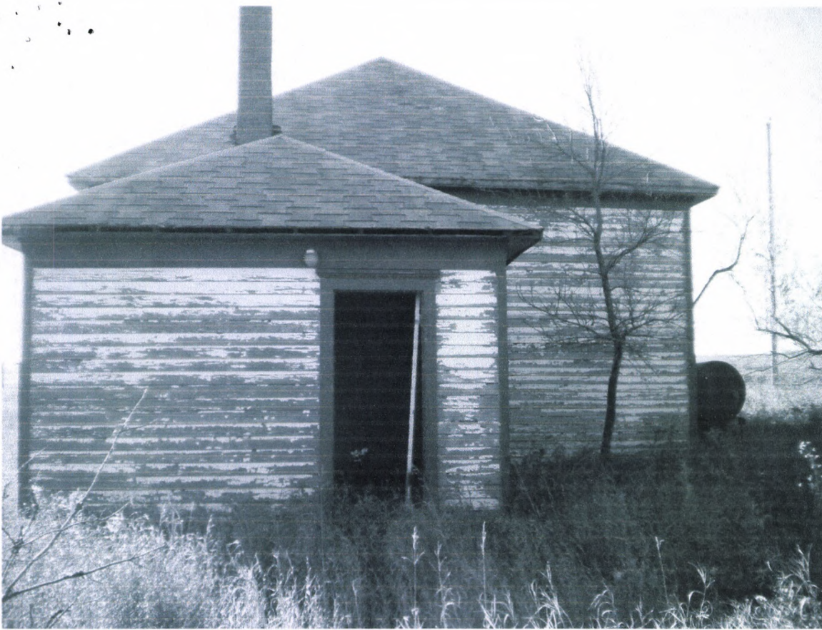
Grandfield Township School 10/22/2010 North Side Kathy Wilner ED