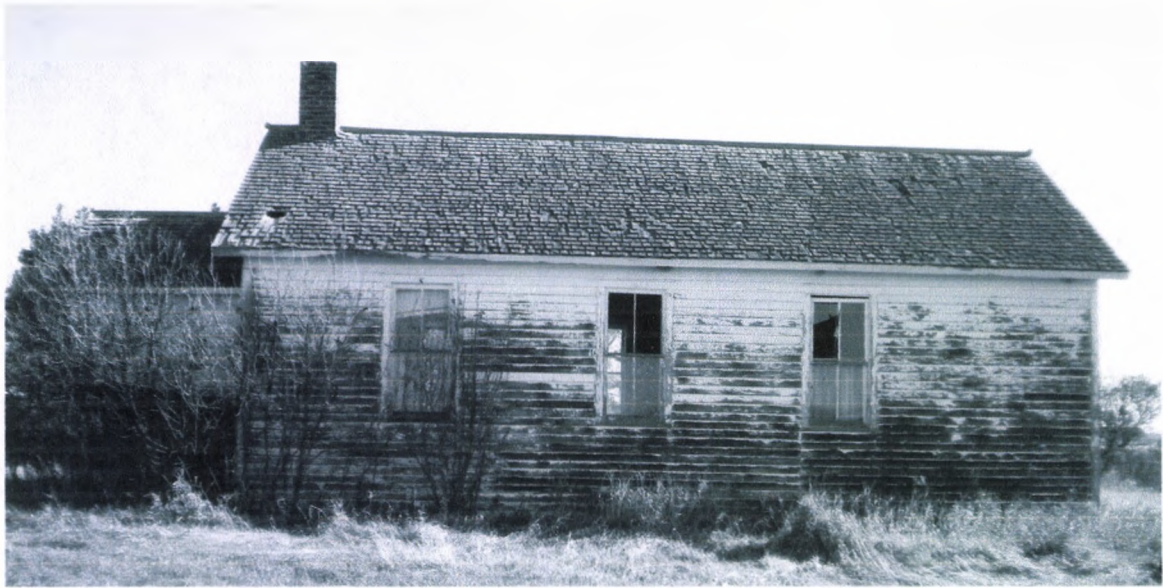
Rocky Mountain School #1 10/22/2010 West Side Kathy Wilner ED