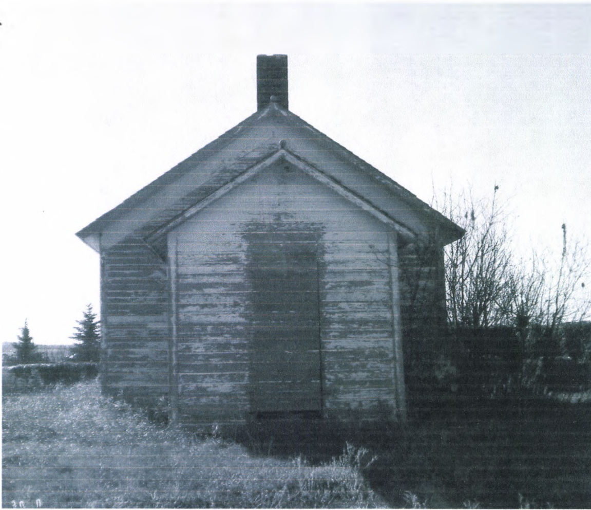
Rocky Mountain School #1 10/22/2010 North Side Kathy Wilner ED