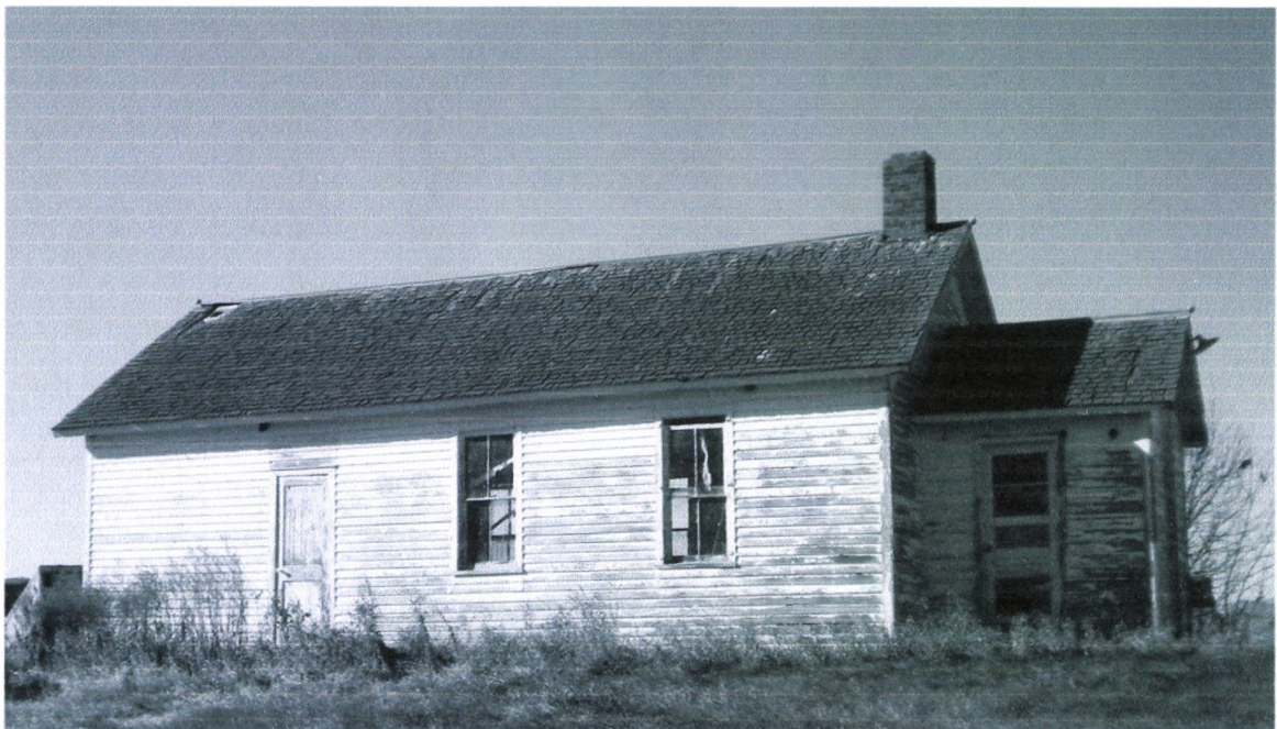
Rocky Mountain School #1 10/22/2010 East Side Kathy Wilner ED