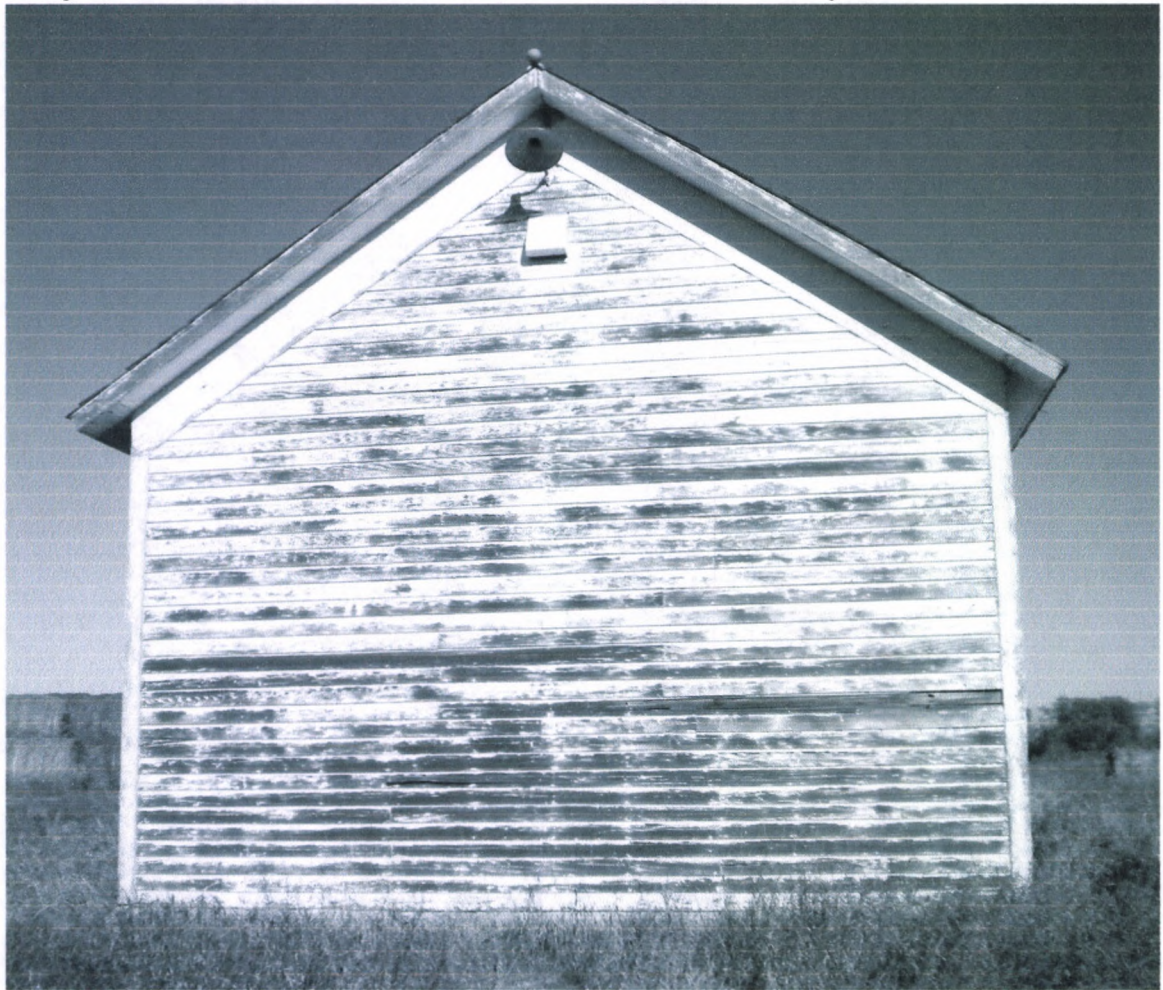
Rocky Mountain School #1 10/22/2010 South Side Kathy Wilner ED