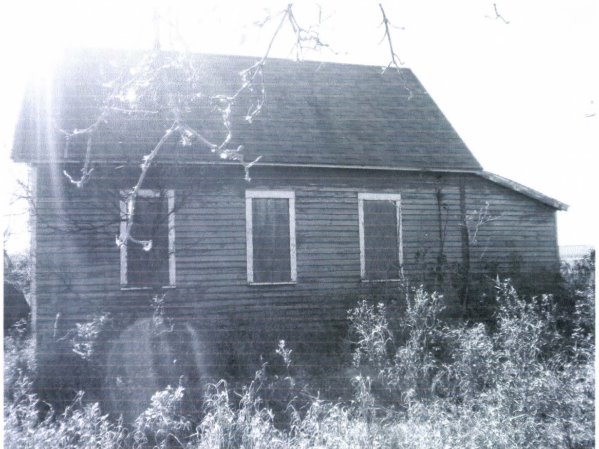
Eddy Township School 10/22/2010 North Side Kathy Wilner ED