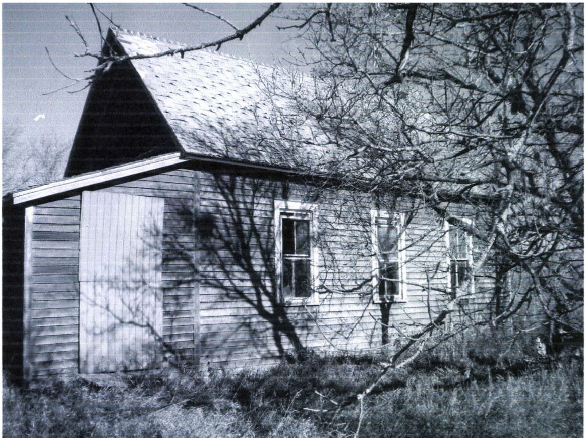
Eddy Township School 10/22/2010 South Side Kathy Wilner ED