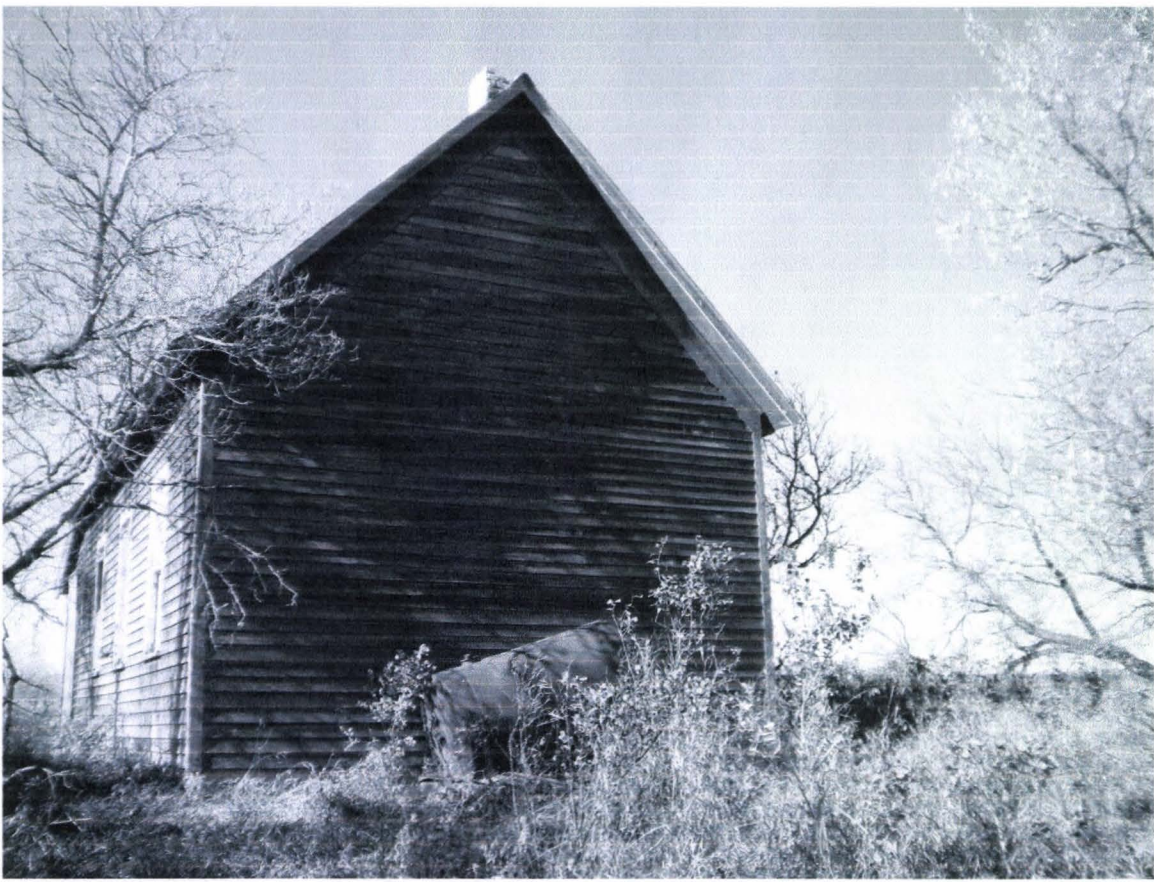
Eddy Township School 10/22/2010 East Side Kathy Wilner ED