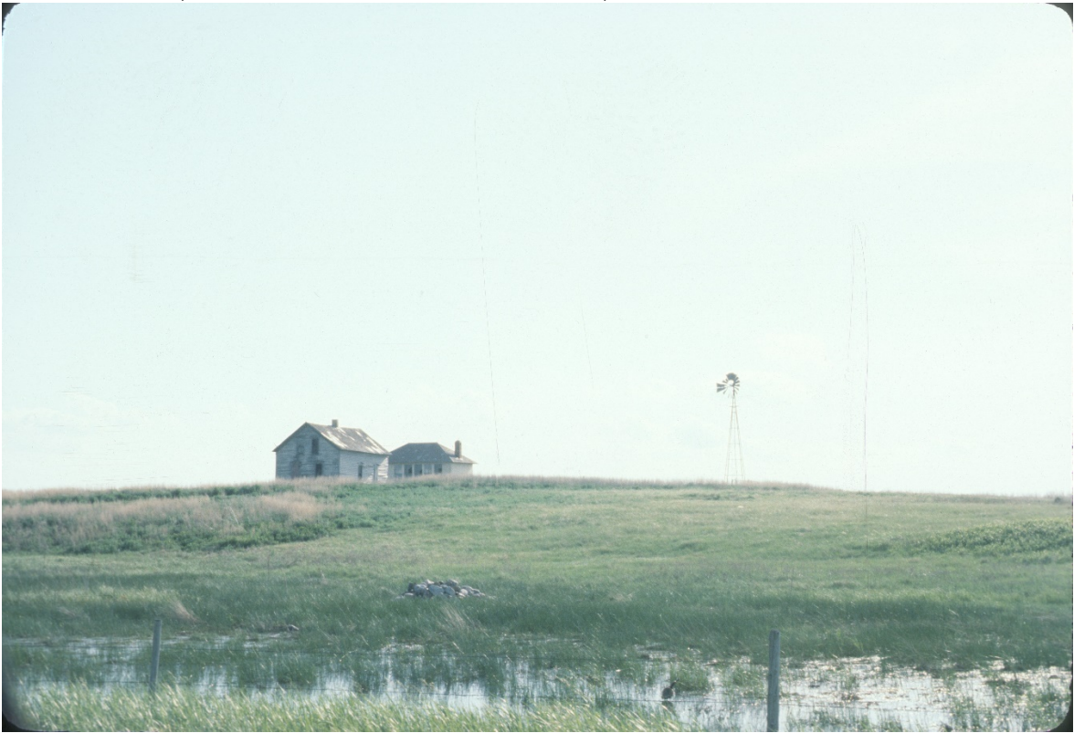
From northeast, scanned from AHP Photo Collection, taken 1979

Recorded By: Lorna Meidinger Date Recorded: 8/5/2021