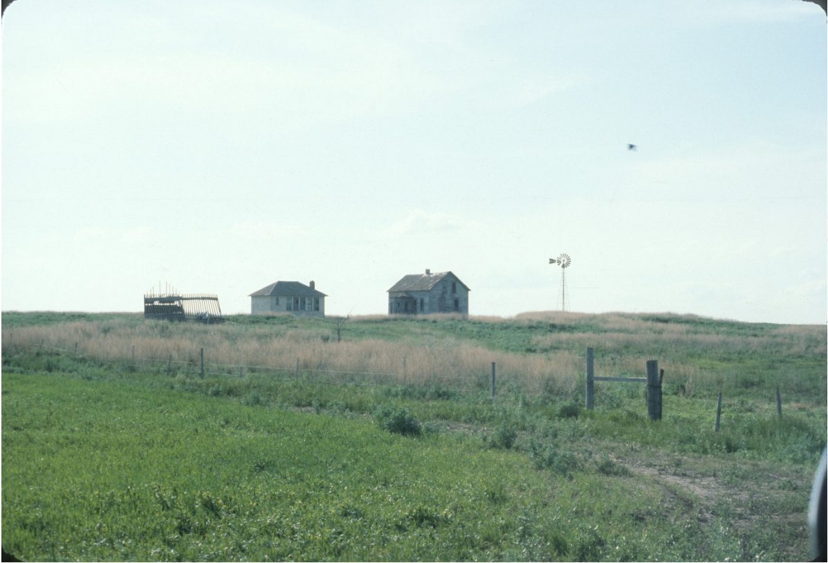
From southeast, scanned from AHP Photo Collection, taken 1979