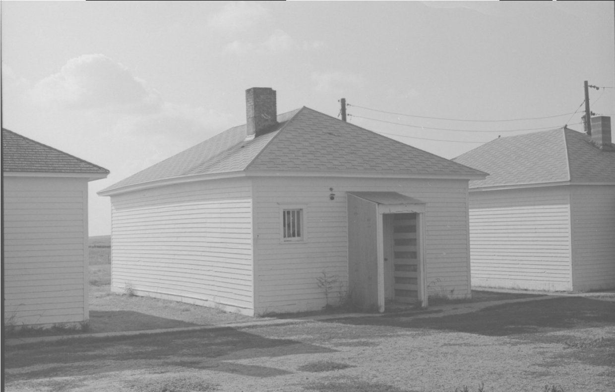
From southeast, scanned from AHP Photo Collection, taken 1979