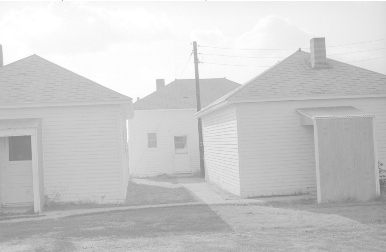
From east, scanned from AHP Photo Collection, taken 1979

Recorded By: Lorna Meidinger Date Recorded: 8/5/2021