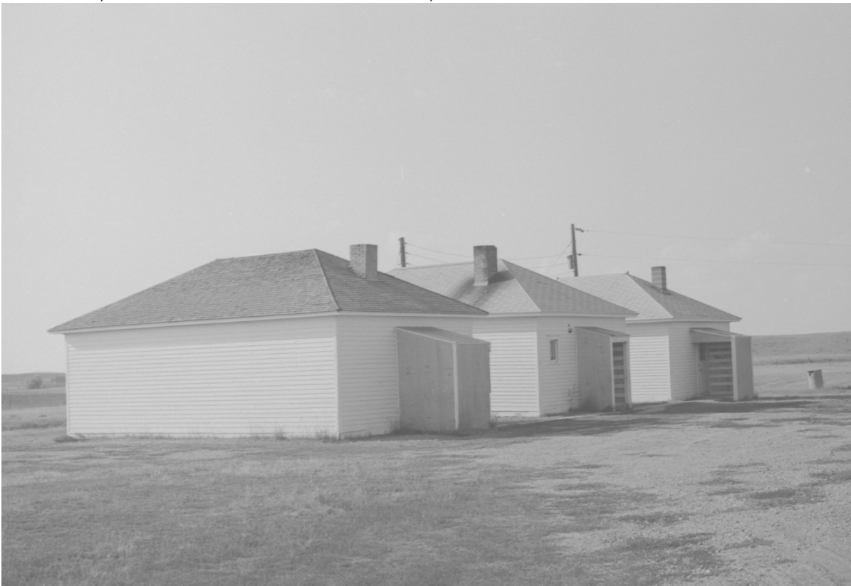
From southeast, taken 1979

Recorded By: Lorna Meidinger Date Recorded: 8/5/2021