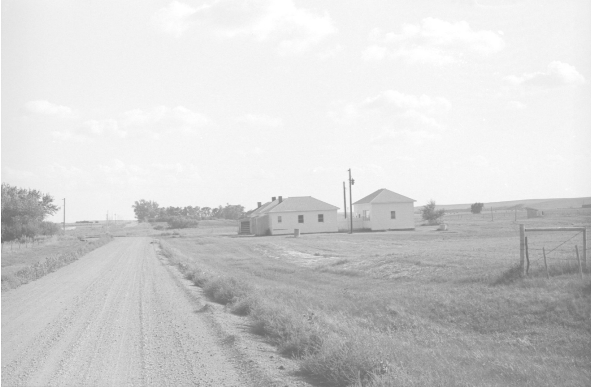
From north, scanned from AHP Photo Collection, taken 1979