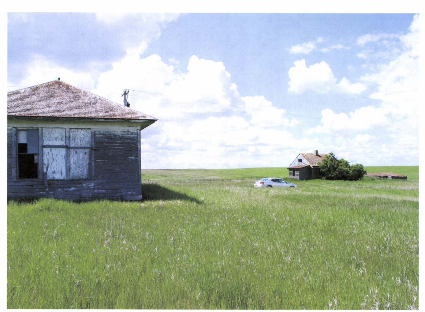
vien to SW - context photo