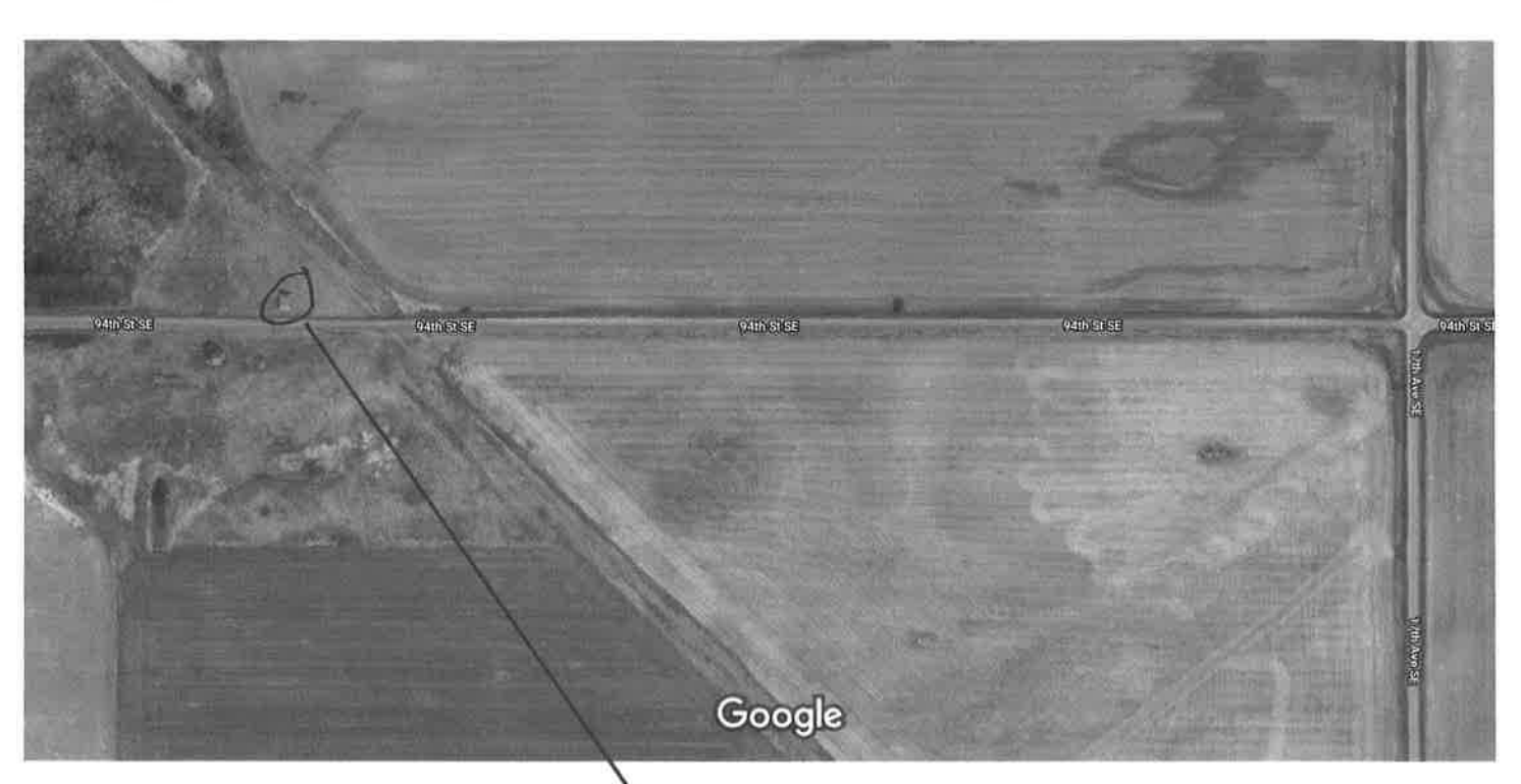
Imagery ©2021 Maxar Technologies, USDA Farm Service Agency, Map data ©2021 200 ft