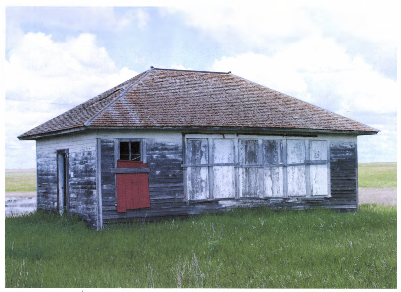
view to W