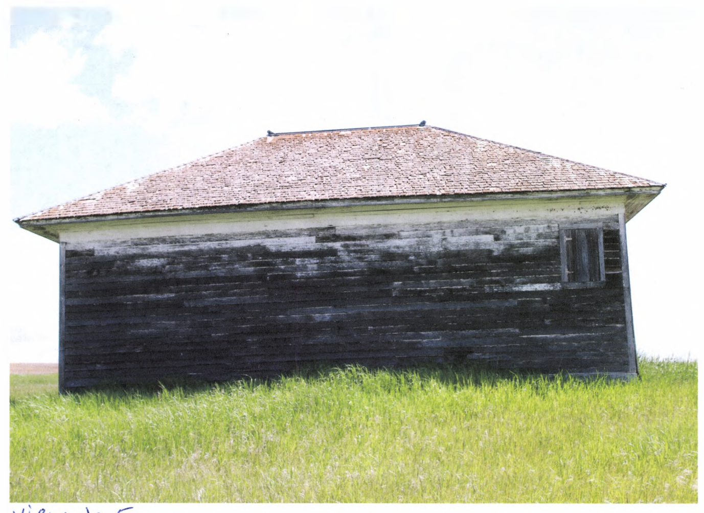
view to E