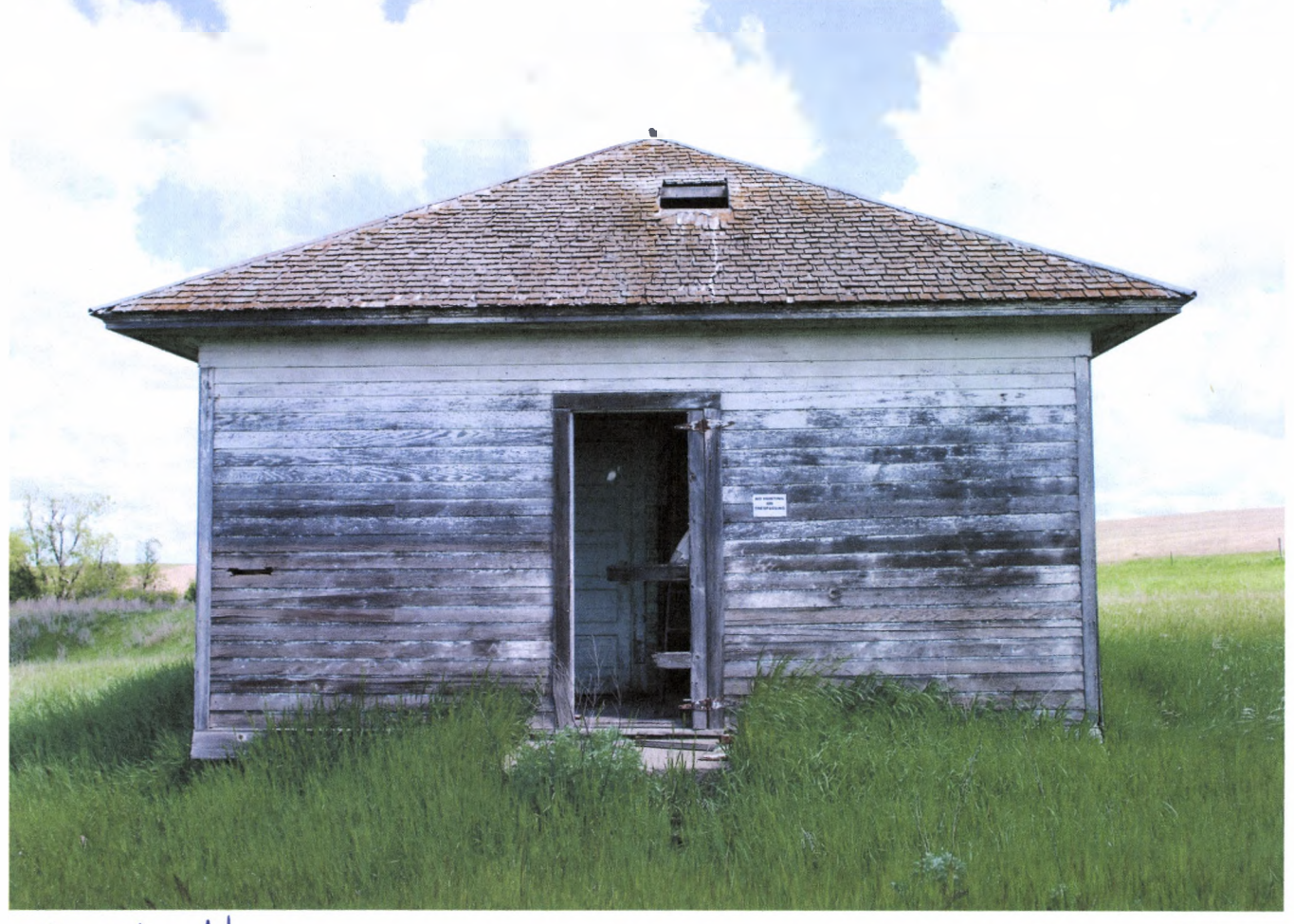
view to N