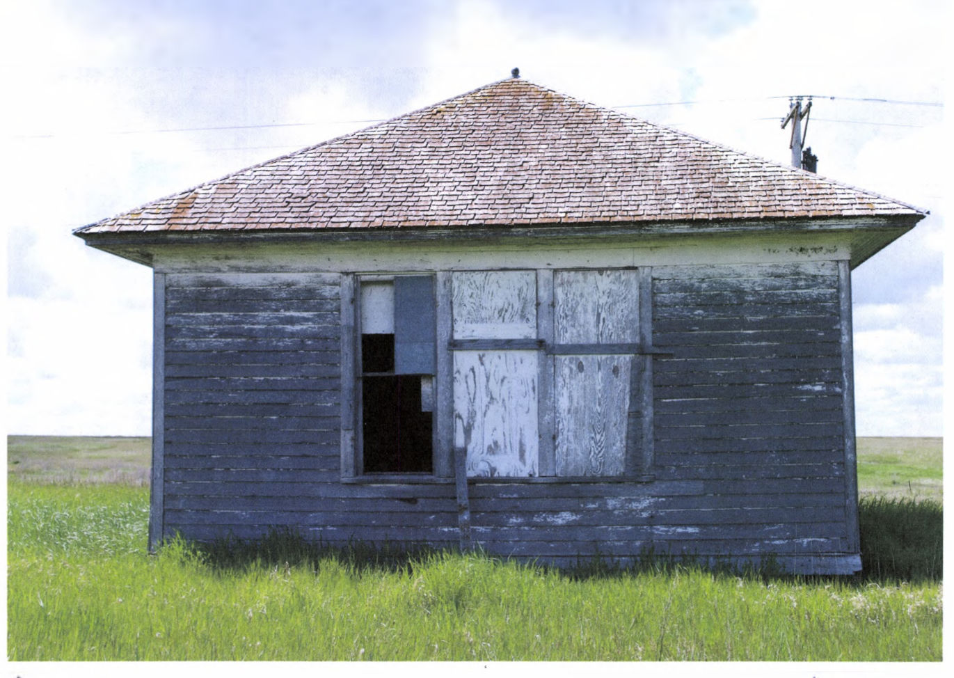
view to S