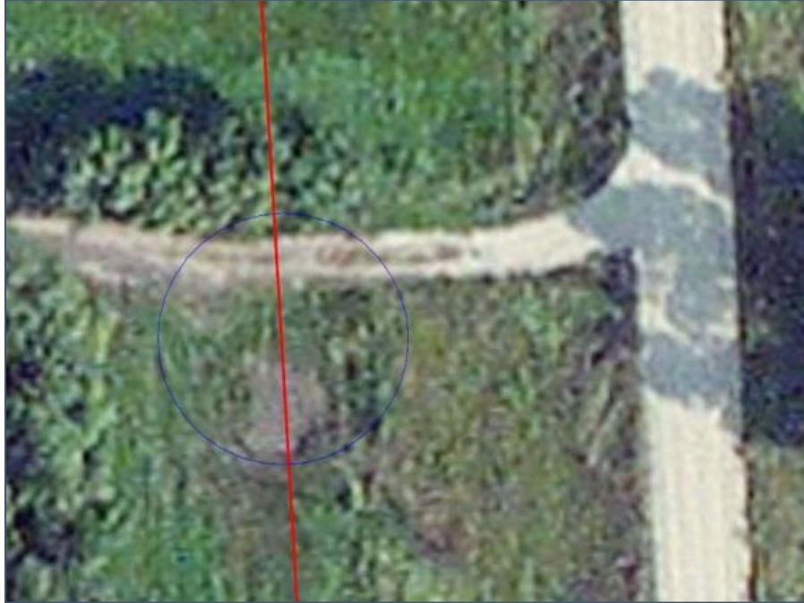
Figure 1. Aerial image with survey area and site boundary shown.