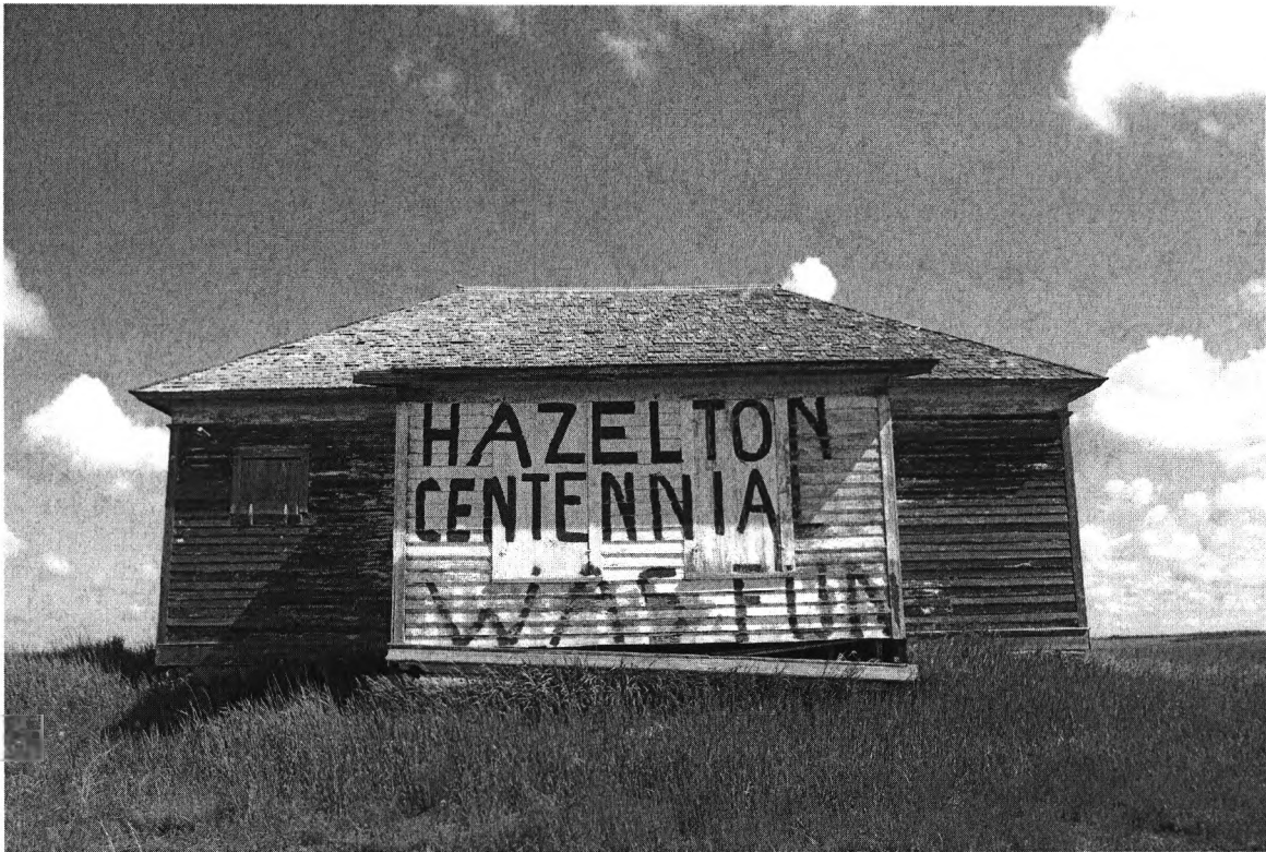
view to N