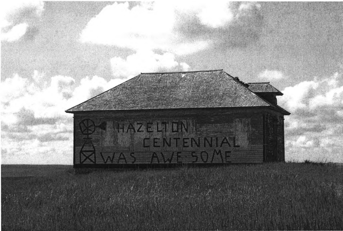
view to S