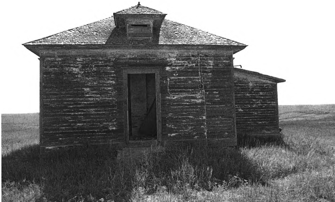
view to E