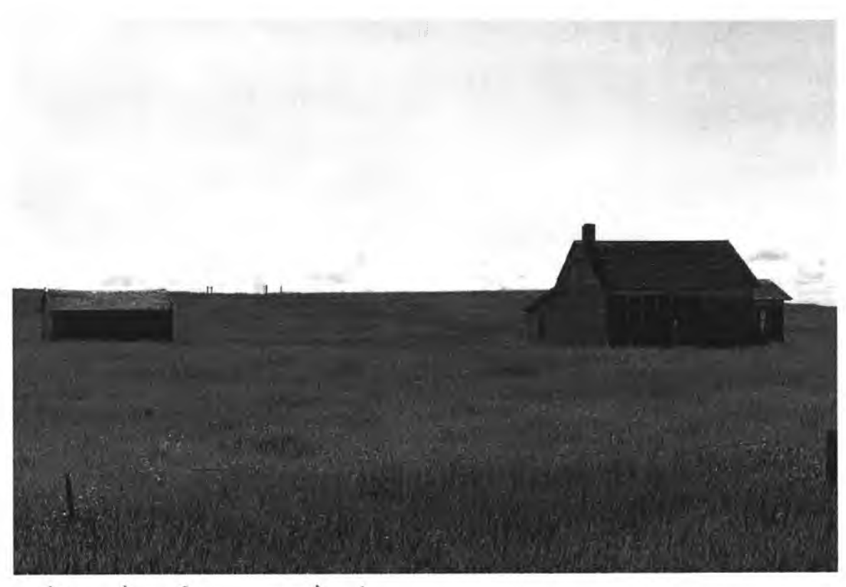
view to SE context