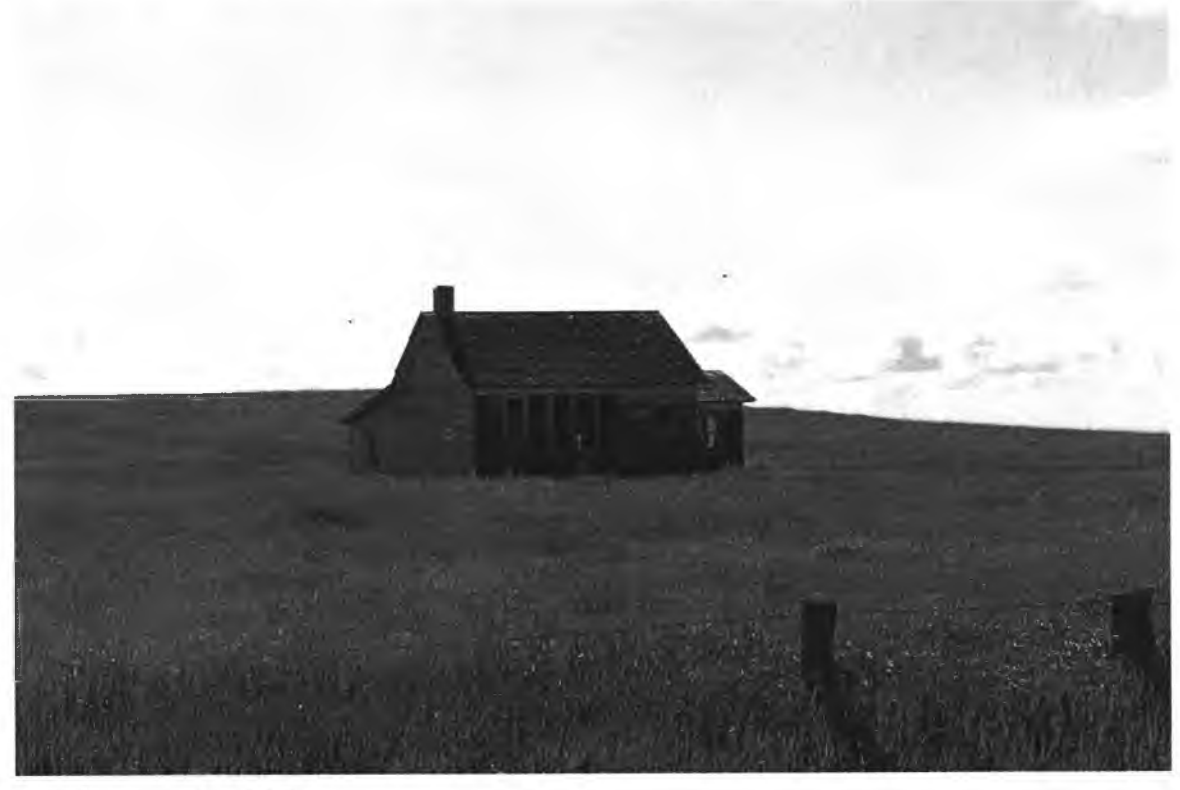
vien to E