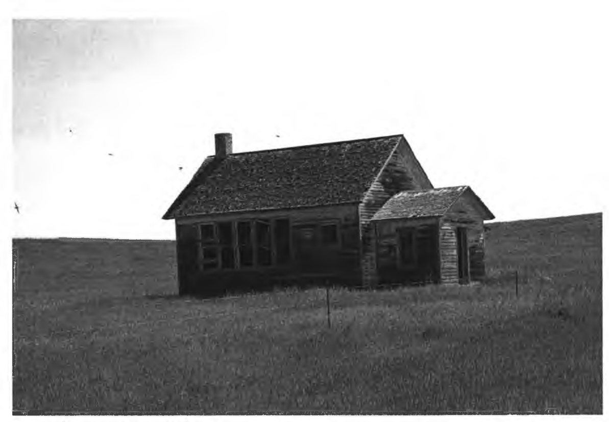
view to NE