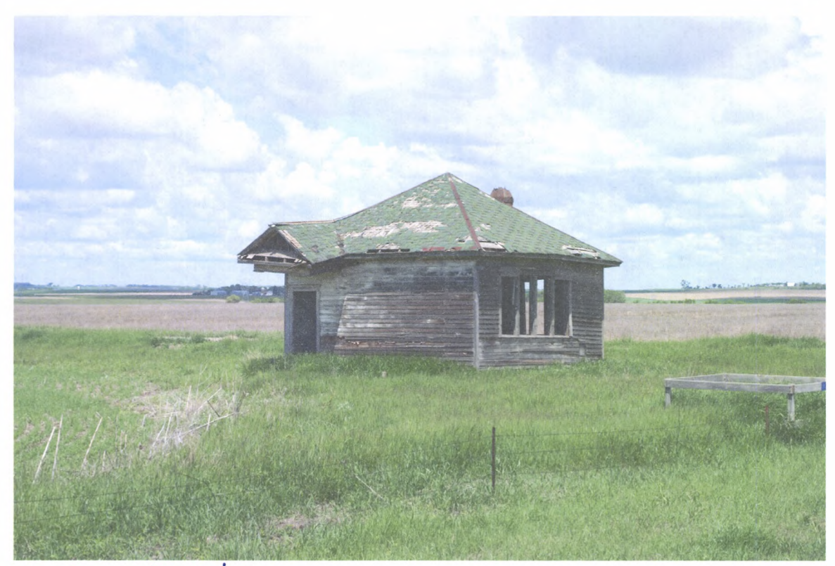
view to N