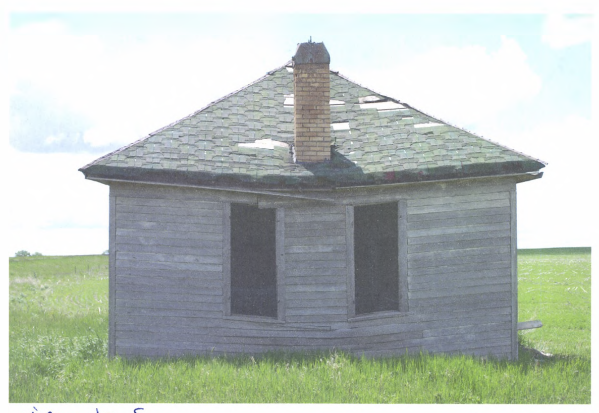
view to S