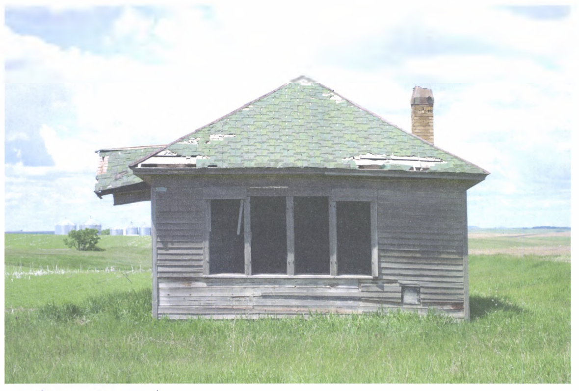
vien to W