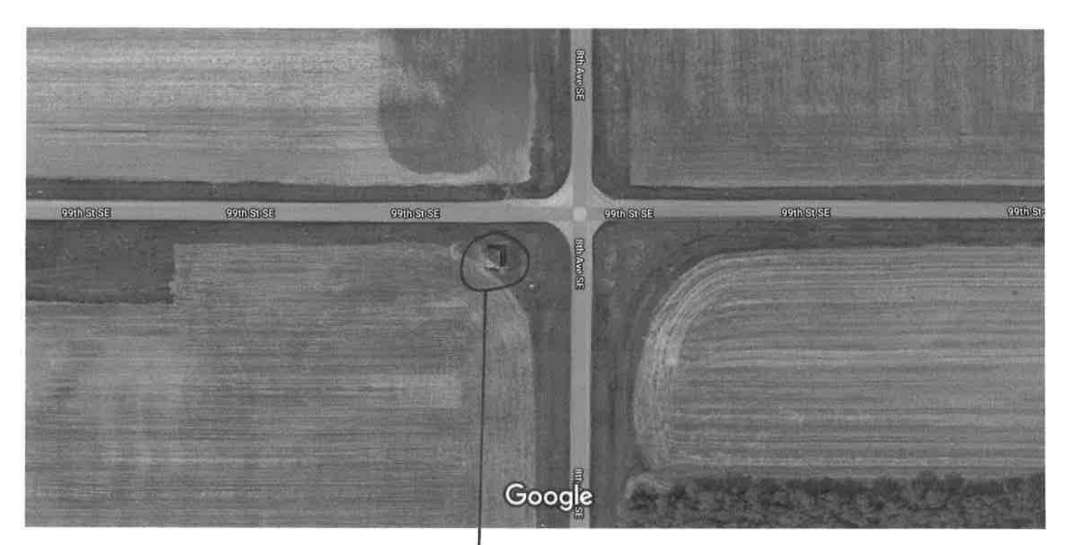
100 f