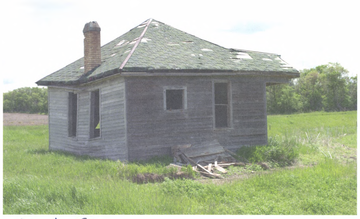
view to SE