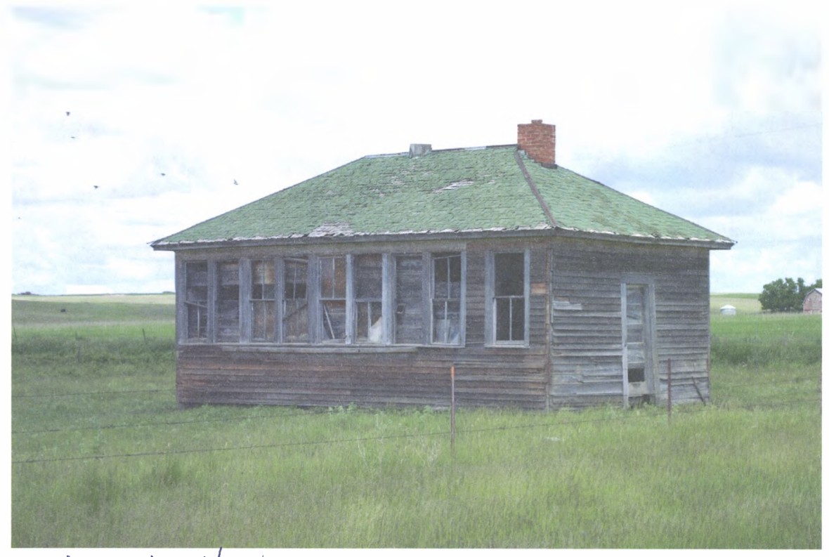
vien to NW