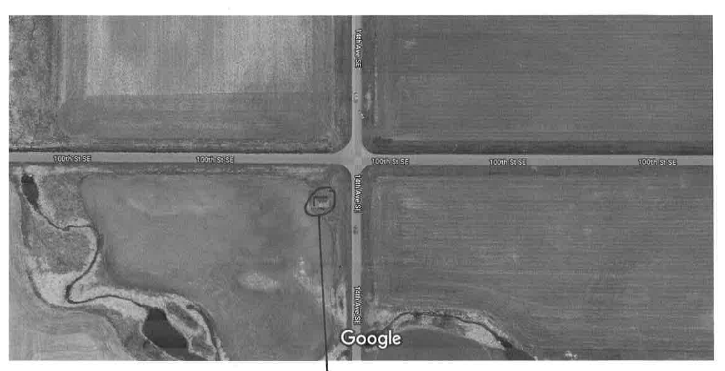
100 ft