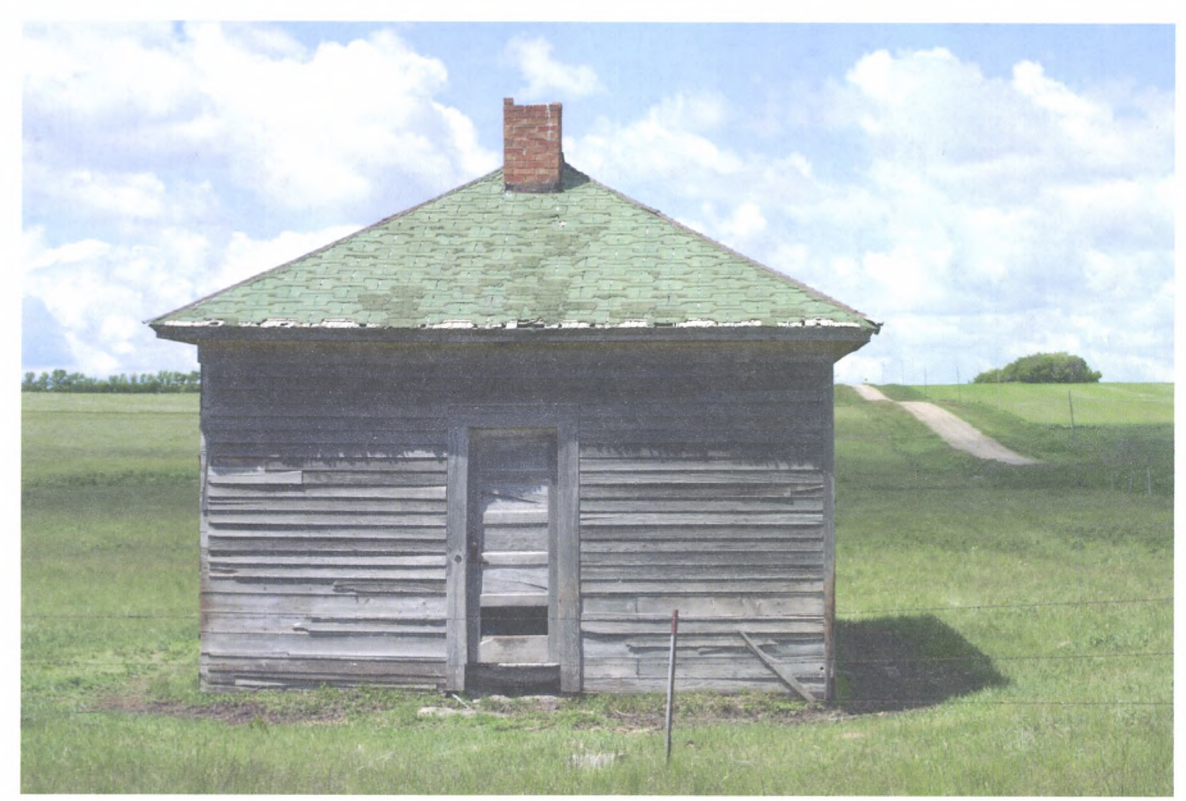
view to W