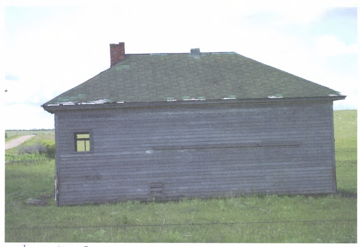
view to 5