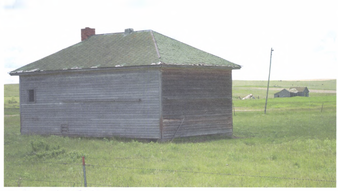
view to SE