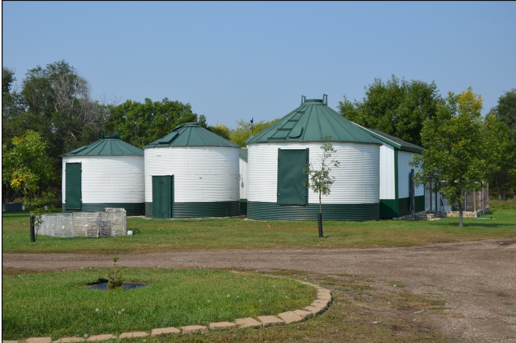
Figure 9. Features 10, 14, 15, and 6-8 (on right), facing north-northwest.

Complete one Attachments Section for the entire site. Include: Topographic map (with quad name and legal description ), sketch map, photographs, and any other attachments.