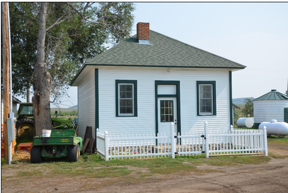
Figure 10. Feature 11, facing east (Feature 16 in right background).

Recorded By Eileen Heideman (First Name & Last Name)