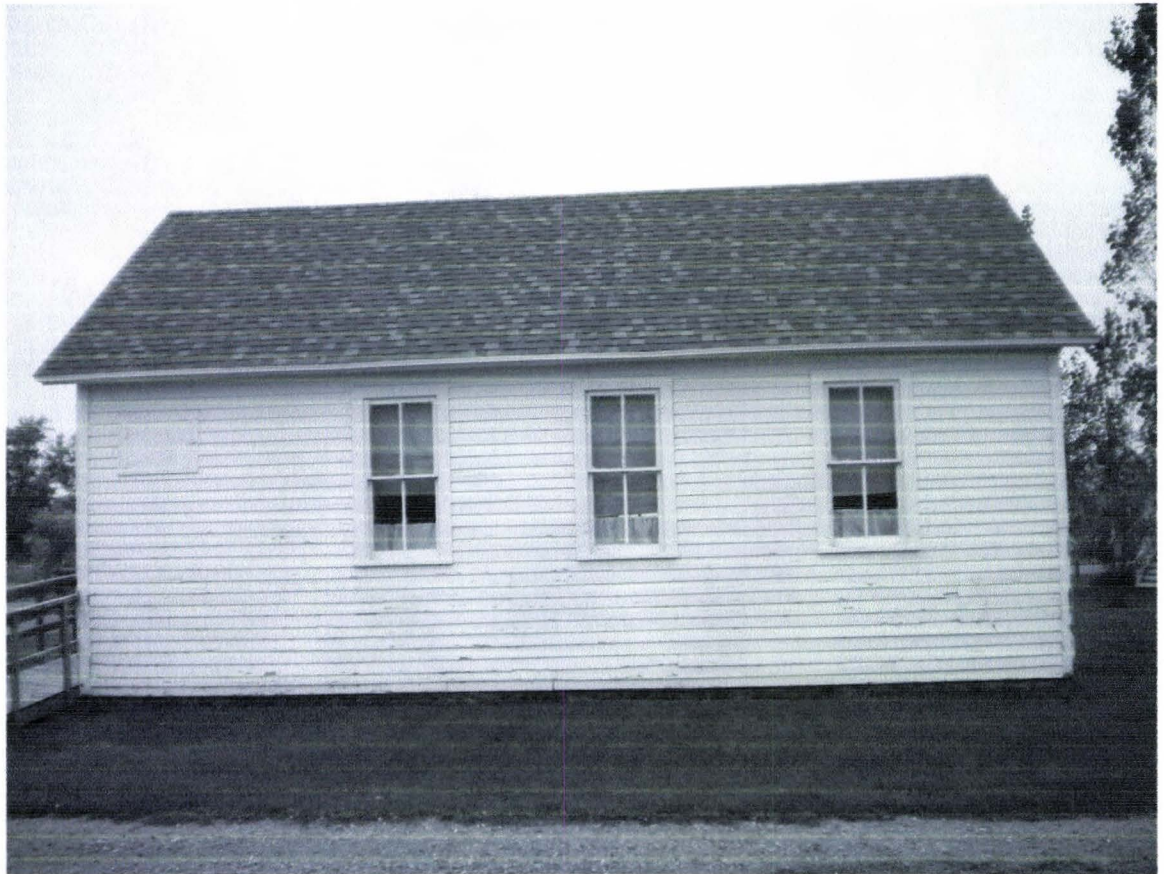
3 – Bucephalia #'s 1 & 3 South side 9/20/2010 Kathy Wilner FO