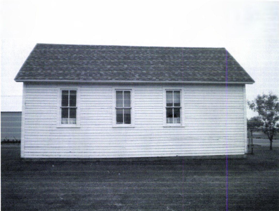
2 – Bucephalia #'s 1 & 2 North side 9/20/2010 Kathy Wilner FO