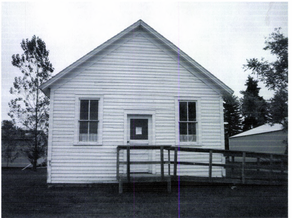
1 – Bucephalia #'s 1 & 2 West side 9/20/2010 Kathy Wilner FO