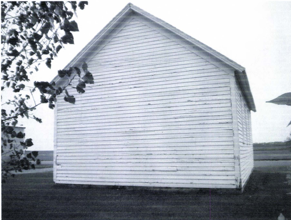
4 – Bucephalia #'s 1 & 3 East side 9/20/2010 Kathy Wilner FO