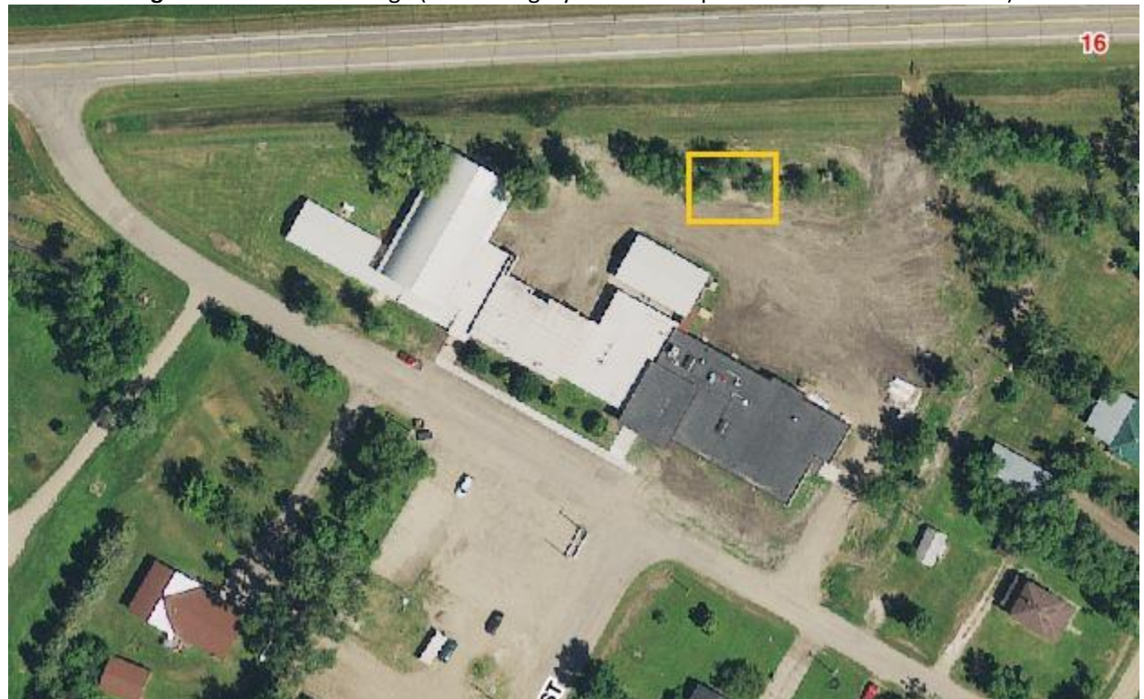
Figure 2: 2019 aerial image (aerial imagery from ND Department of Water Resources)

Recorded By: SHSND Date Recorded: 5/12/2022