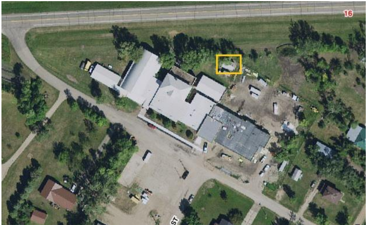
Figure 1: 2018 aerial image (aerial imagery from ND Department of Water Resources)