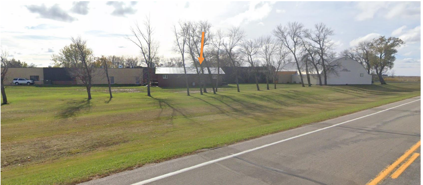
Figure 4: 2021 street view, view southwest (Google Earth imagery)

Recorded By: SHSND Date Recorded: 5/12/2022