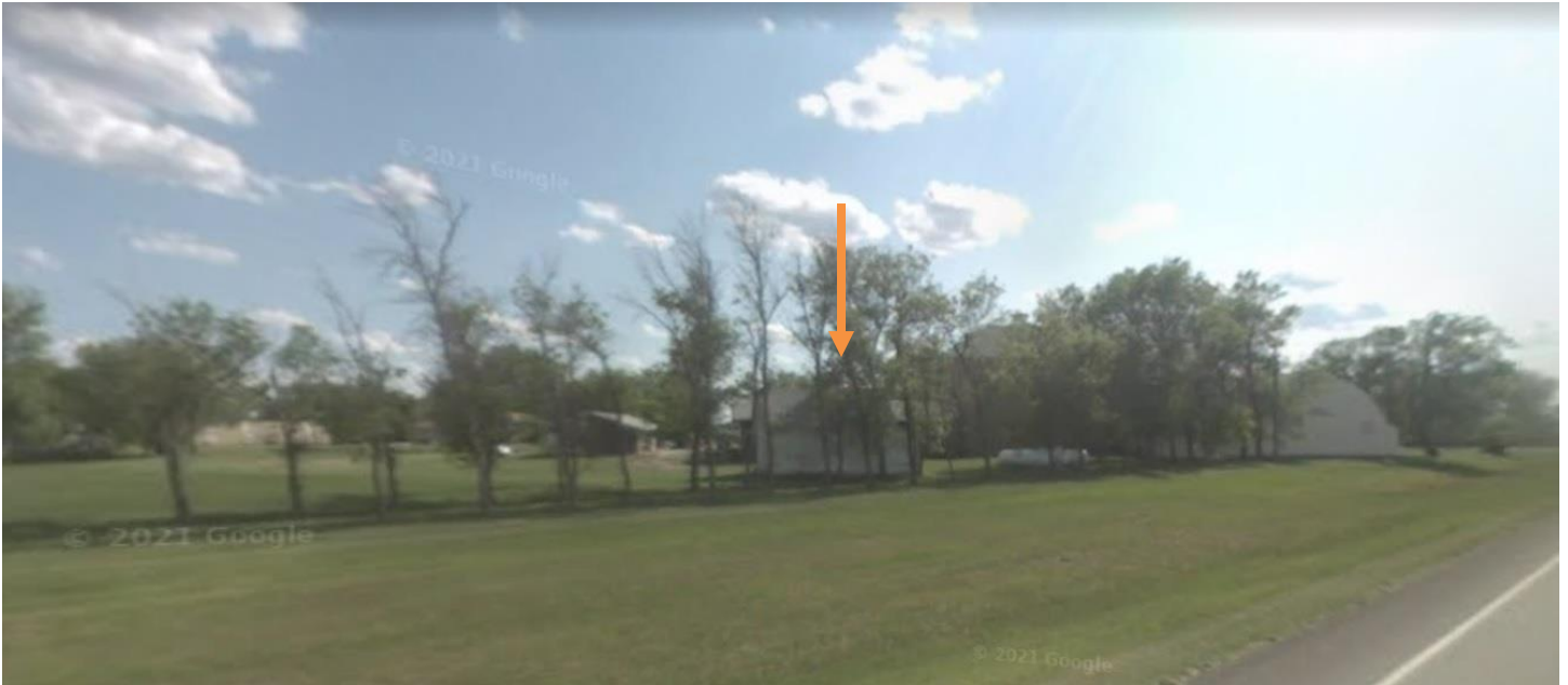
Figure 3: 2009 street view, view southwest