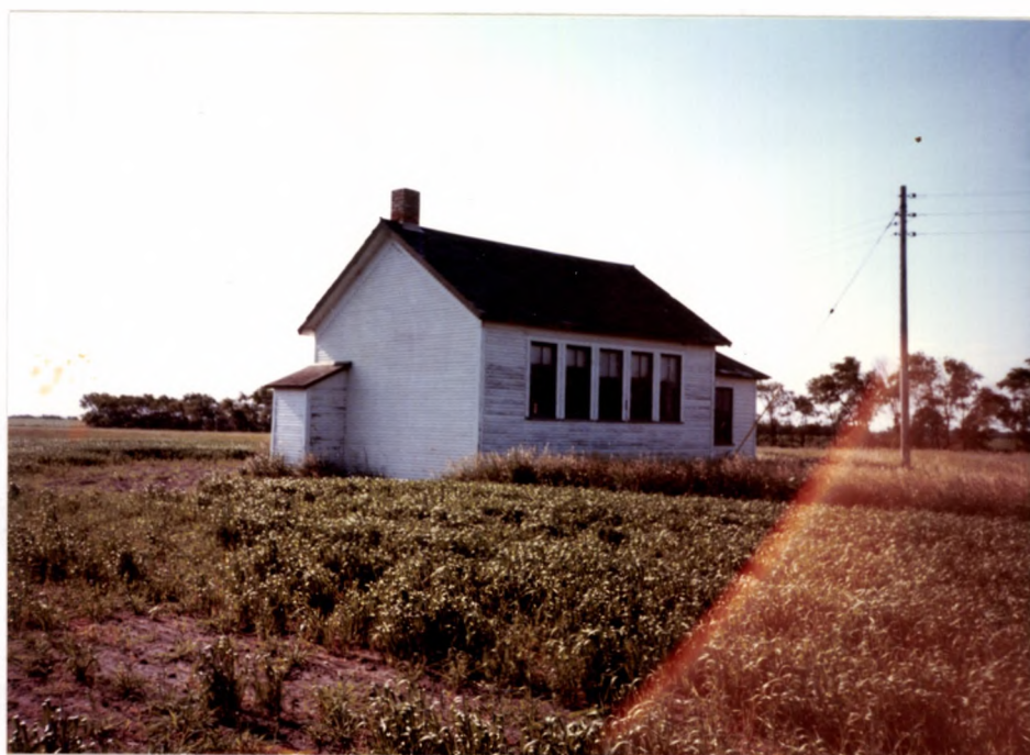
LT237, Feature 1, view to the southeast (Roll 7, Frame 20)