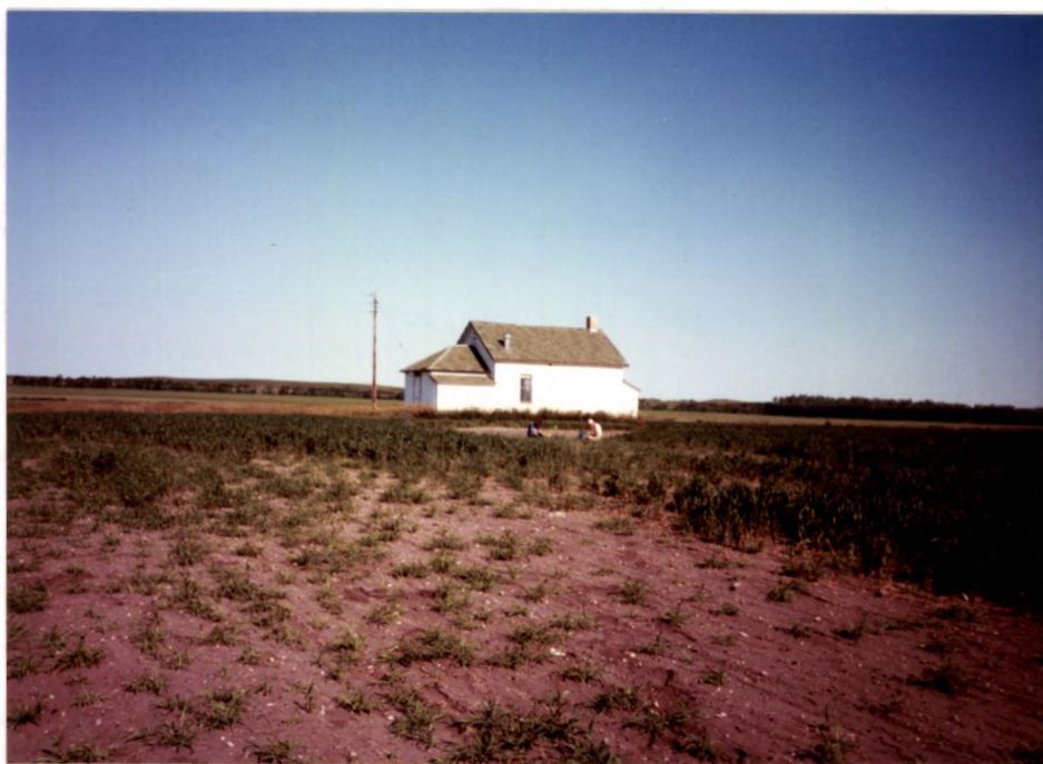
LT237, Feature 1, view to the northwest (Roll 7, Frame 19)